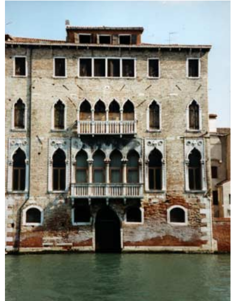
The Palazzo Pesaro-Papafava viewed from the canal