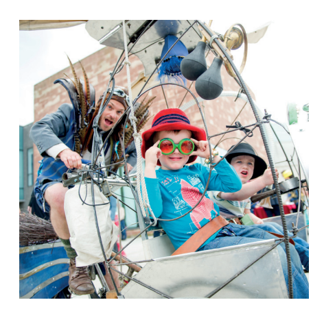
WARWICK ARTS CENTRE FAMILY WEEKEND 2015 SAT 28 & SUN 29 NOVEMBER, 10AM-5PM

Our regular Family Days & Weekends are a firm favourite and this winter we invite you to journey through a programme of events and activities that are sure to keep you entertained for the whole day. There'll be workshops, performances, sports activities and lots of free things to do as we all Go on a Journey . So grab a pen and jot the date in the diary.