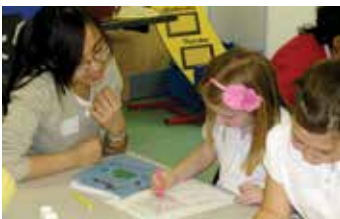
Warwick Volunteers in Coventry schools

sale of their organic, home-made frozen yoghurt. Working with local schools, Viva La Yog! will engage Coventry children living in poverty through fun tasting and activity sessions, whilst educating them about the importance of a healthy, balanced diet.