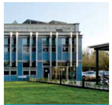
In 2009 the Clinical Trials Unit building was completed at Gibbet Hill at a cost of £400m

In 2009 the Clinical Trials Unit building was completed at Gibbet Hill at a cost of £400m. The Unit now boasts 24 separate trials across its four major work streams of musculoskeletal conditions including injury prevention and management, cancer, clinical trials methodology and systematic reviews. This resource is also credited with raising the quality of clinical practice in the local area.