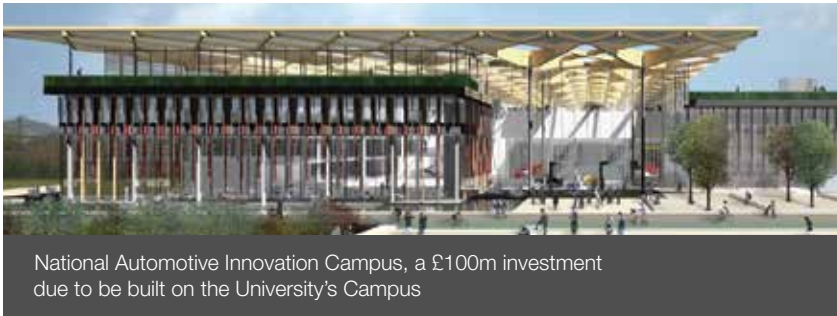
National Automotive Innovation Campus, a £100m investment due to be built on the University's Campus

As part of the University's internationally-renowned approach to working with business, WMG has developed a close relationship with Jaguar Land Rover, a major employer in the region. JLR has located 180 of its R&D staff on campus as part of a programme which will generate £100m of collaborative research over 10 years. JLR and Tata are also funding, with the UK government, the development of the National Automotive Innovation Campus at Warwick; a £100m investment in a state-of-the-art new building on the University's campus announced at the end of 2012.