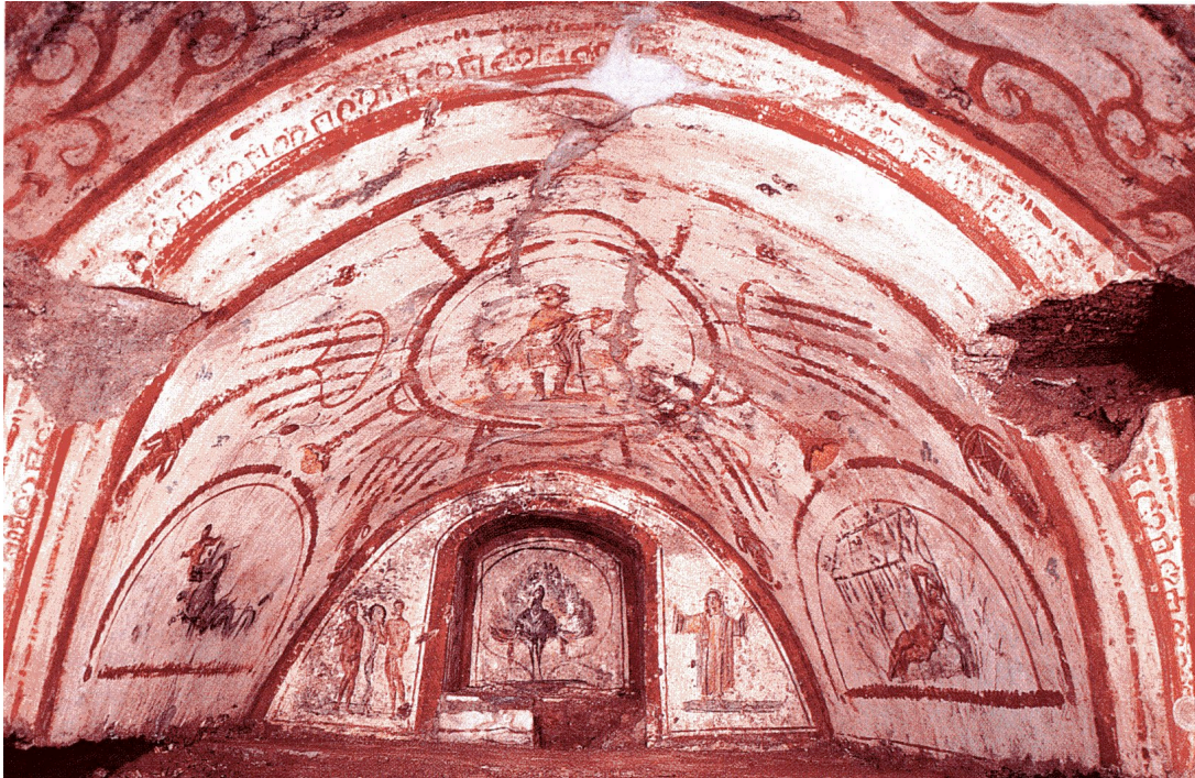
Arcosolium with Jonah, Adam & Eve and orant