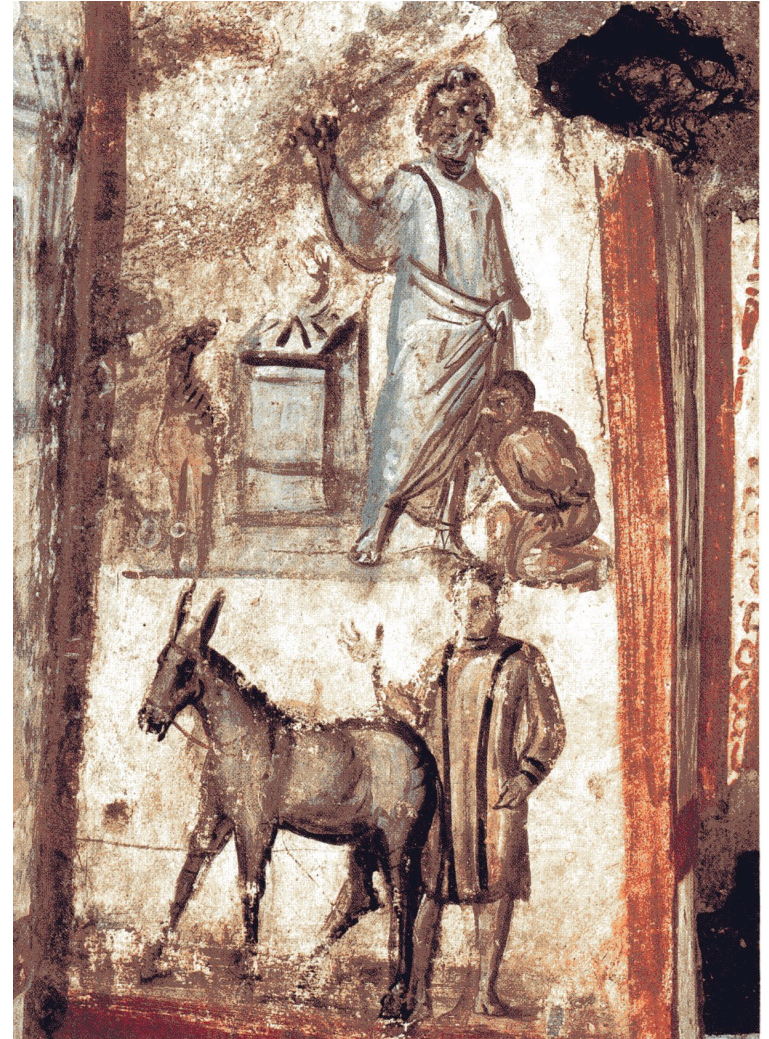
Sacrifice of Isaac (to right of arcosolium)