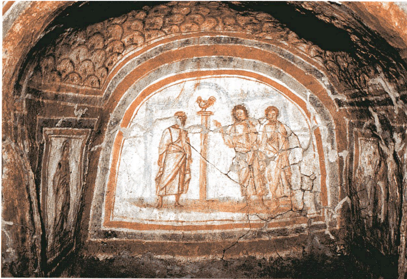
St Peter denies Christ