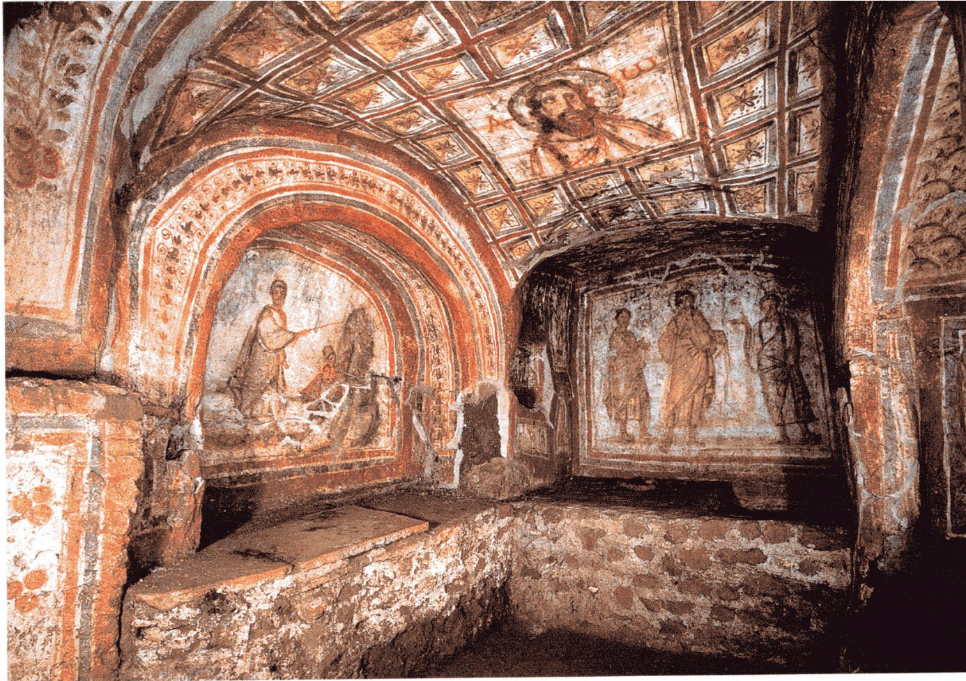
St Peter striking water from rocks; Christ with Saints Adaeuctus & Felix