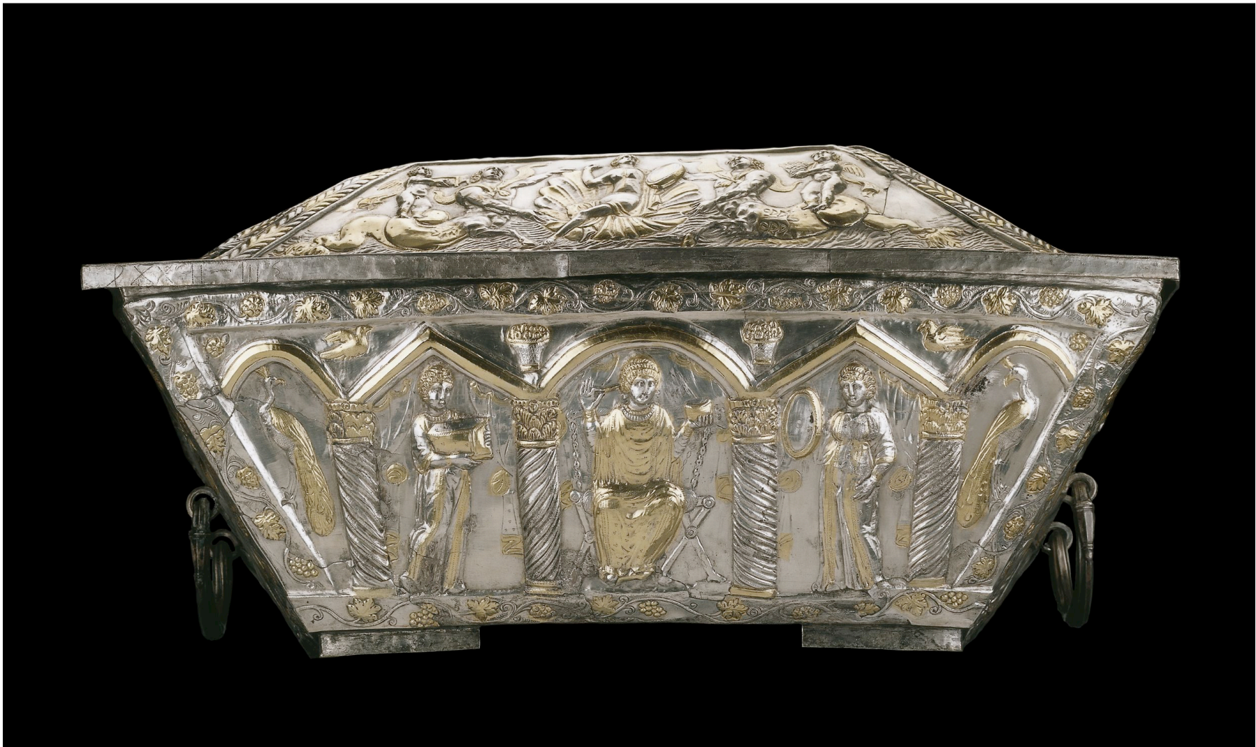
Proiecta casket: side view