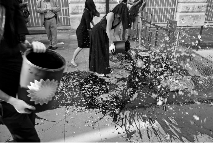
Figure 1.2: Licence to Spill, Liberate Tate, June 2010, Tate Britain.

a letter in The Guardian that day, calling for an end to BP sponsorship of Tate. Signatories to the letter included the playwright Caryl Churchill and the artists Sonia Boyce, Hans Haacke and Suzanne Lacy.