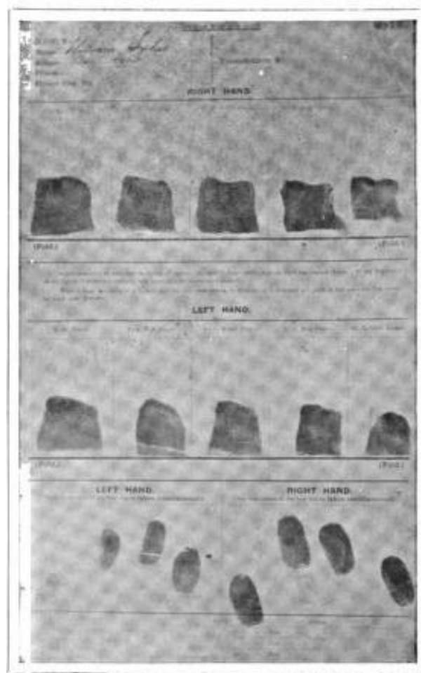
FIG. 1.—AN OFFICIAL CHART OF FINGER-PRINTS.

"It will probably be of interest, not only to the majority of police forces in the country, but to the public at large, to know that the use of finger-prints has been employed by the Bradford police force now for some eighteen months not only for the identification of criminals, but for the detection of crime. The system has been adopted most extensively in India. It was so successful there that its utilization was recommended for this country. Mr. E. R. Henry, now at the head of the London police, is the chief authority on the subject. Mr. Henry has done much to make the science familiar, and he has had many followers. In a sense Scotland Yard is the headquarters of the finger-print department. The finger-prints of all persons remanded to, or incarcerated in, gaols for certain offences are taken, and records of the impressions are sent to Scotland Yard, where they are registered and preserved."