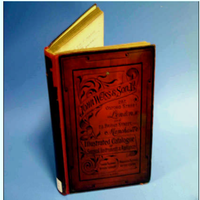
John Weiss & Sons, Illustrated Catalogue of Surgeons Instruments and Appliances , 1901

I analysed the ways in which producers successfully shaped catalogues to suit practitioners' professional and practical requirements. The medical profession accepted catalogues as a form of advertising, despite professional obligations to distance medicine from commercial trade practices.