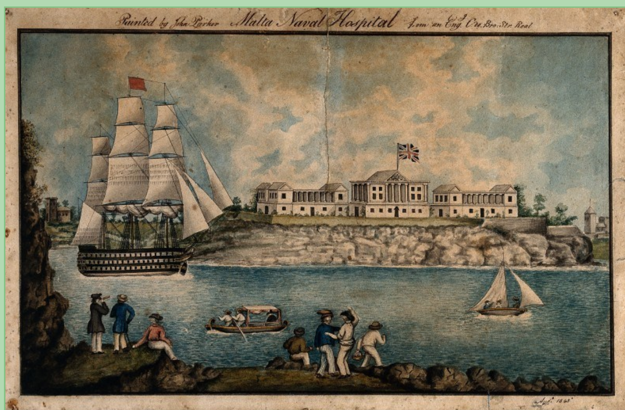
The Naval Hospital at Bighi Malta