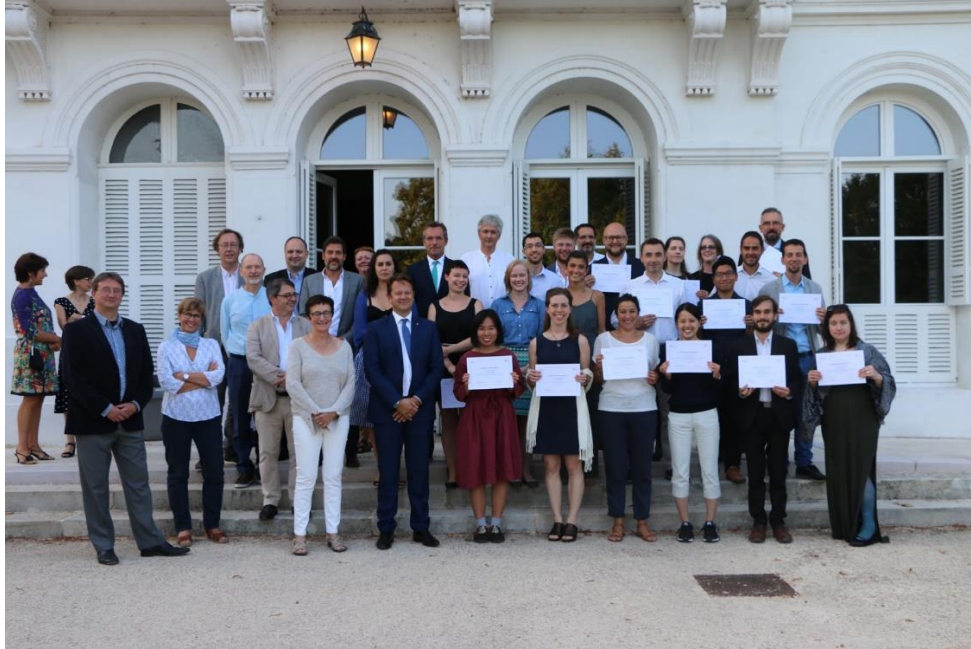
Class of 2018

alternative, non-conventional perspectives and to broaden the regions and cultures studied. May it continue to invest in academic excellence, not neglecting its commitment with the larger society and vigilant concern for contemporary world issues.