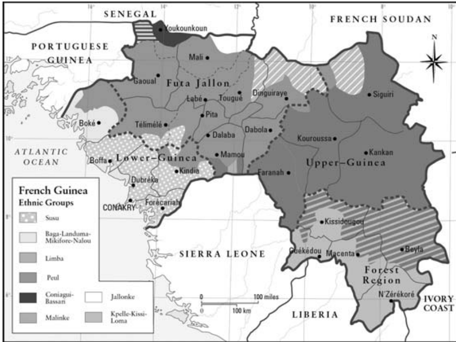
Map of French Guinea.

Implicit in the majority of assessments is the erroneous assumption that the leaders called the shots and that the political positions taken by high-level nationalist leaders were mirrored in the views of their constituents. In the case of the RDA, many scholars have presumed that the accommodationist line promoted by Ivory Coast parliamentarian and interterritorial RDA president, Félix Houphouët-Boigny, was embraced by territorial branches and local sections – with the notable exception of Guinea in 1958. 2 These scholars generally have not recognized that the party line was the product of struggle, representing the domination of one point of view over others, accompanied by the silencing of opposing voices. Exceptions to this generalization are scholars who have noted the 1955 rift, when the Union Démocratique Nigérienne, Union Démocratique Sénégalaise and Union