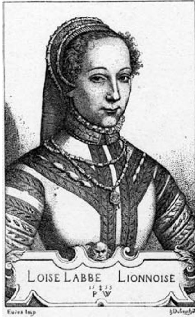
Figure 1. Engraved portrait of Louise Labé by Pierre Woeriot in Lyon in 1555, the only known portrait drawn during her lifetime.