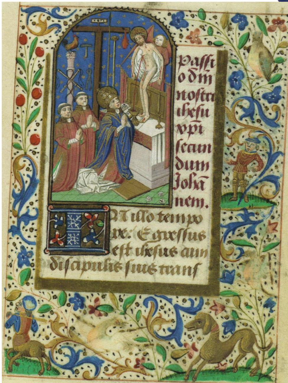
Figure 2. Mass of Saint Gregory at the beginning of the passion according to Saint John, 1469, f.126r, The Prayer Book of Charles the Bold , The J. Paul Getty Museum, Los Angeles. A. De Schryver, The Prayer Book of Charles the Bold A study of a Flemish masterpiece from the Burgundian court (Los Angeles: The J. Paul Getty Museum, 2008) via https://historyofbooks.wordpress.com/2010/03/22/