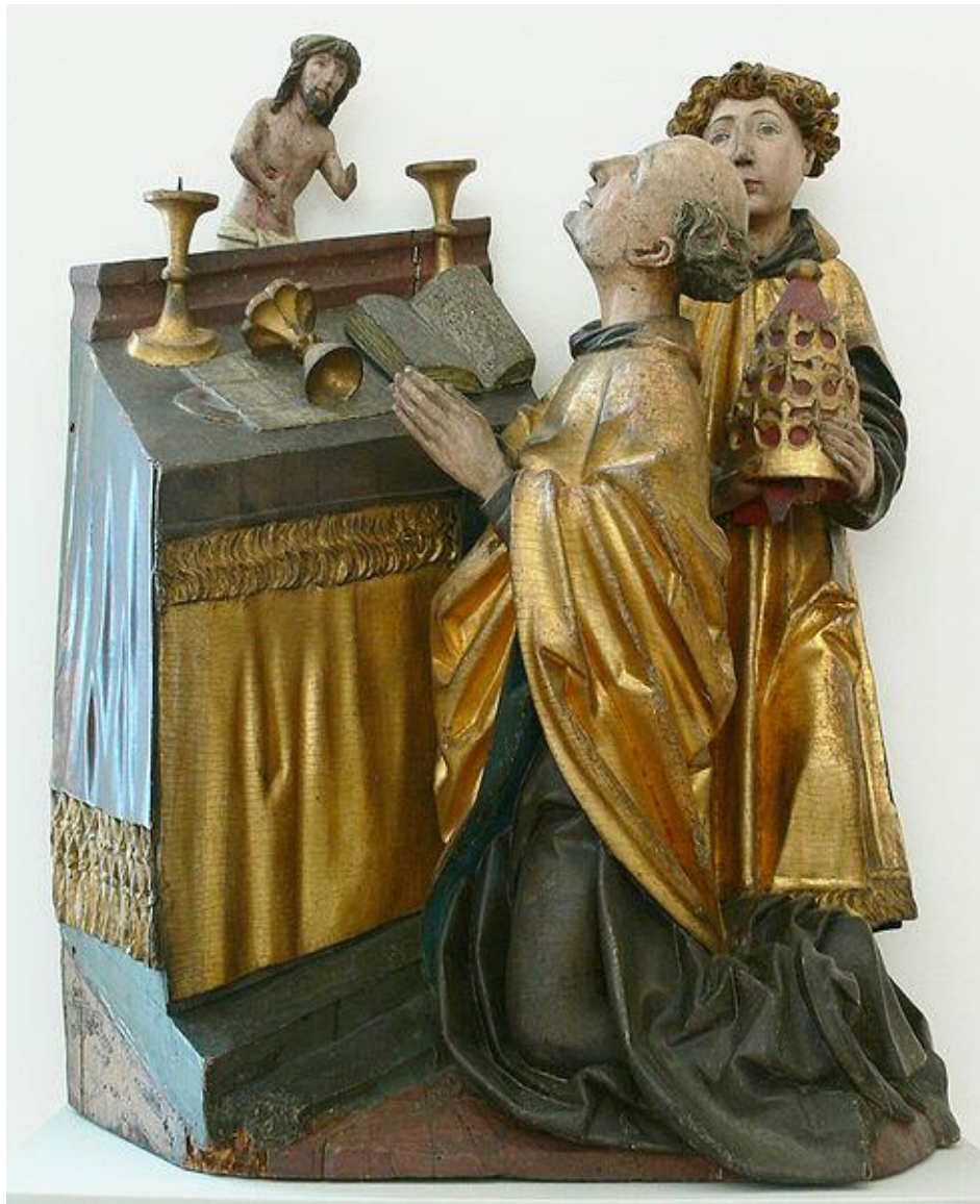
Figure 3. The Mass of St. Gregory , c. 1480, limewood, original colours, Bode-Museum, Berlin.