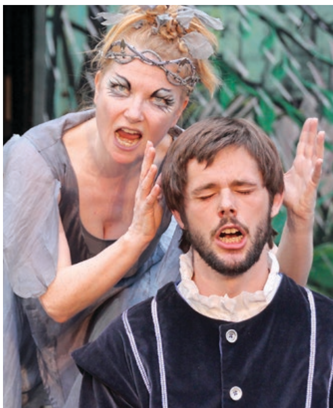
The Tempest at Shakespeare at the George in Huntingdon (2016).

This report details our findings and reveals how their association with the RSC has or has not shaped the way the company's amateur partners rehearse, perform, and conceptualize their own theatre practice. Reciprocally, this study also illustrates how engagement with amateur practitioners has influenced the work of the professional artists employed by the programme and considers the programme's resonance within the RSC more