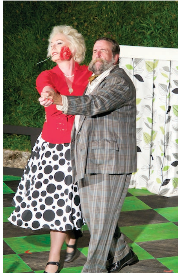
Merry Wives of Windsor at The Inn Theatre Company in Dartmouth

Open Stages places skills development at the heart of the initiative with the expectation that each amateur production selected for the programme will contain ‘some genuine RSC “DNA”’.