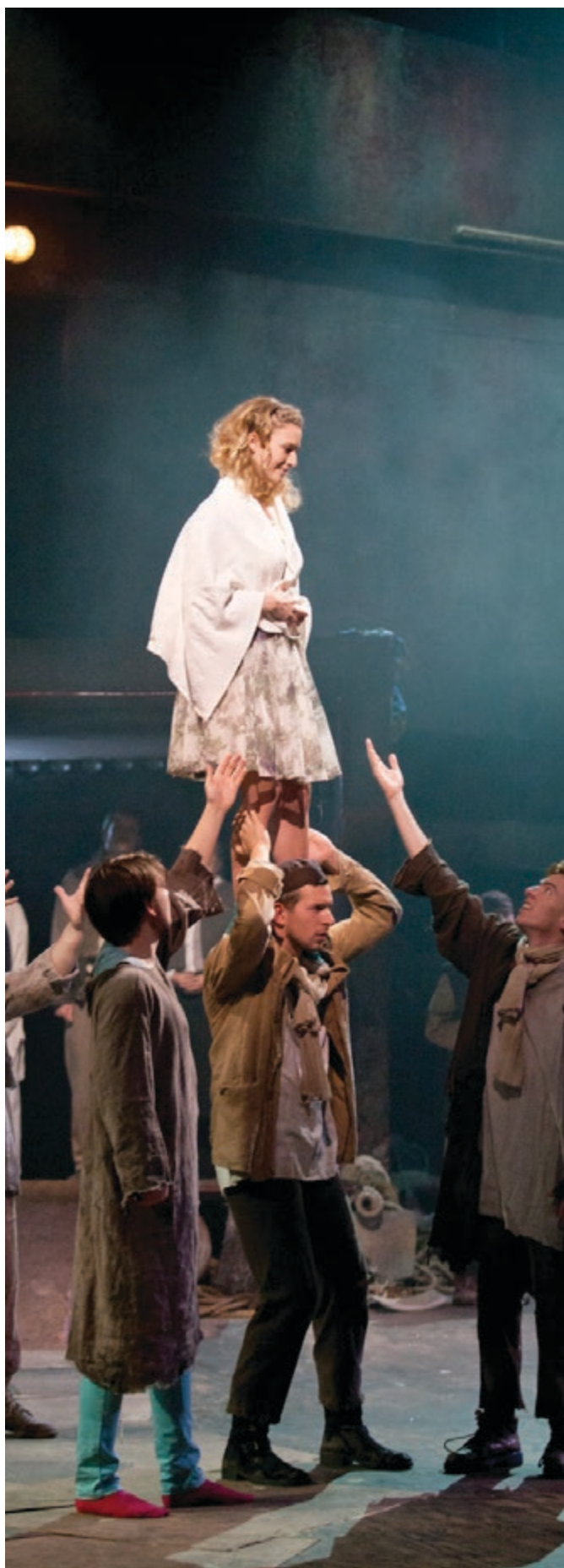
Pericles at the RSC, courtesy of the company

programme, Open Stages functioned primarily as outside confirmation of something they already knew to be true – that amateur theatre matters.