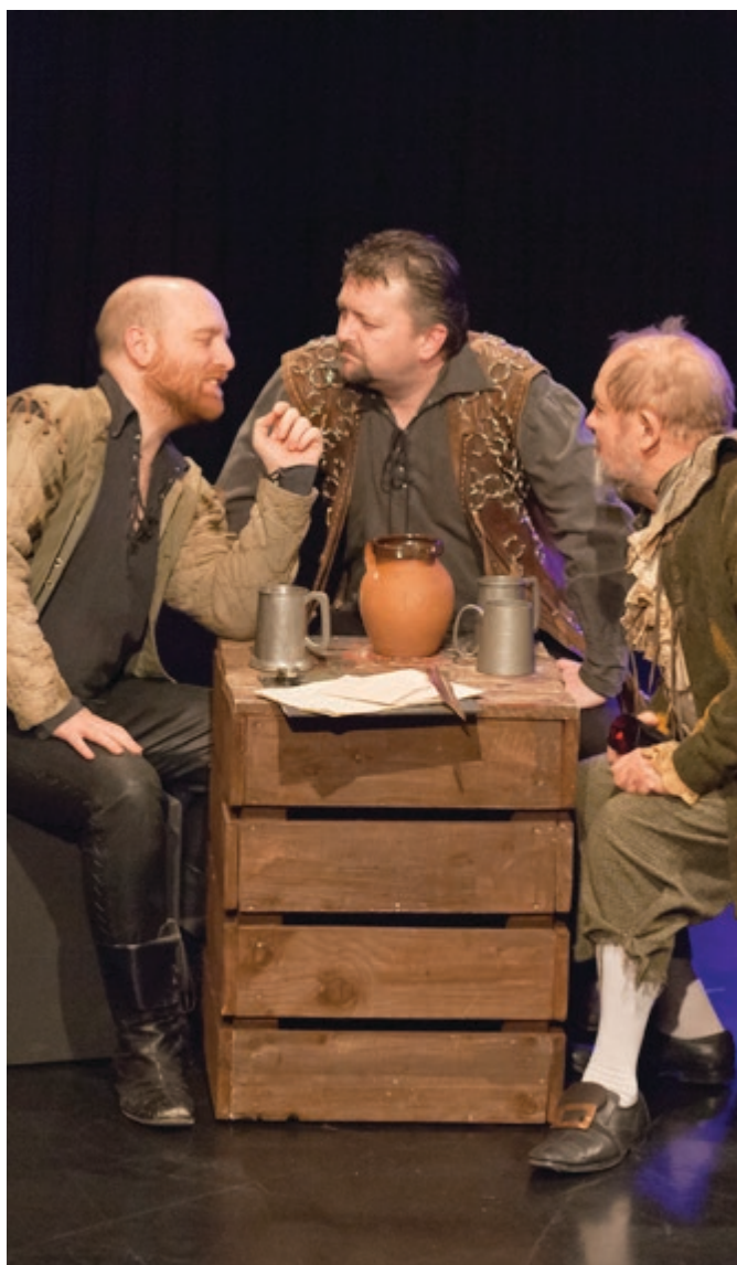
Measure for Measure at Everyman Theatre in Cardiff (2015)