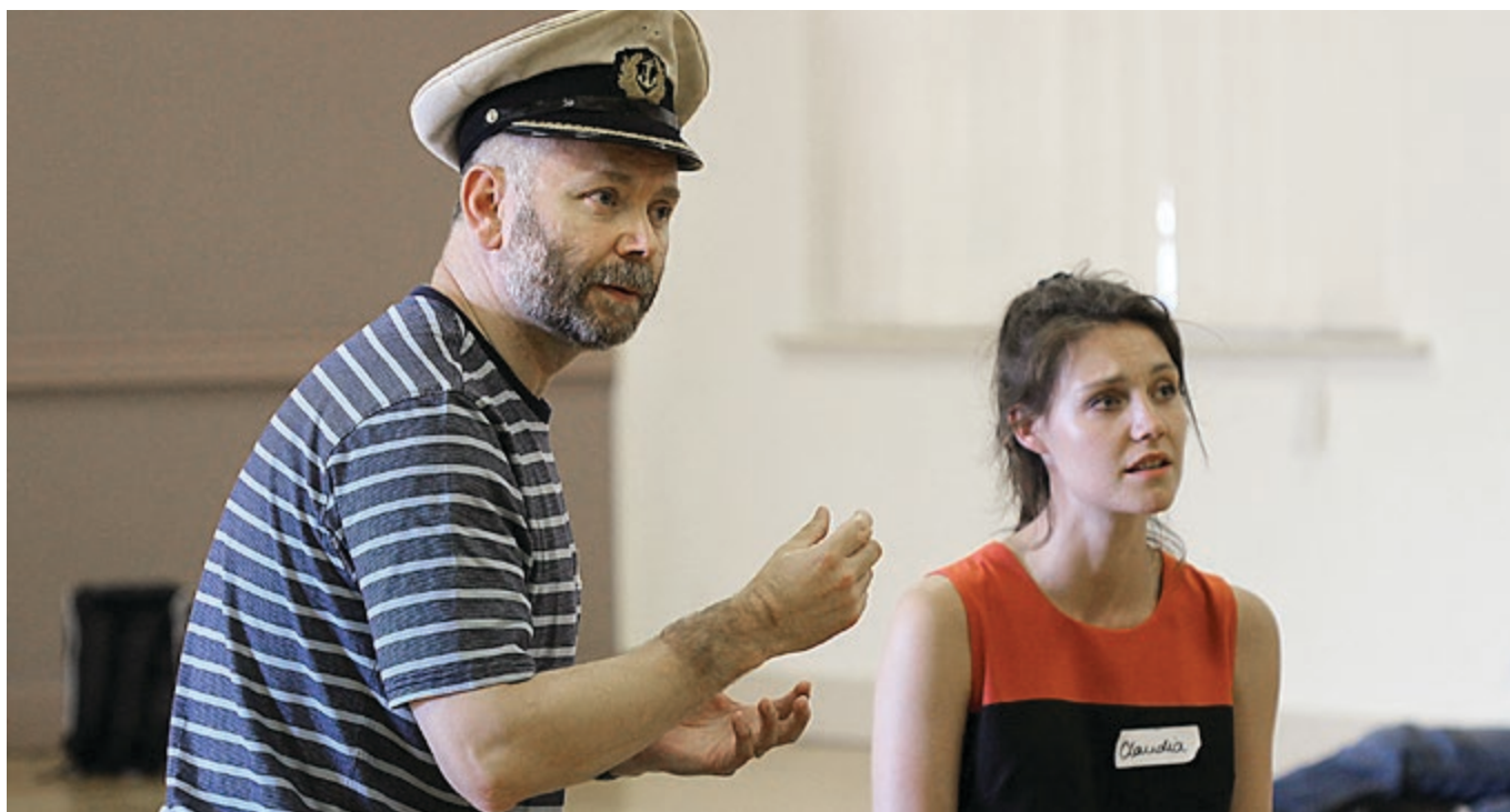
Llanymech Amateur Dramatics Society rehearses Twelfth Night (2016), courtesy of the company

does speak to an important point, which is that Open Stages functioned differently in different regions.