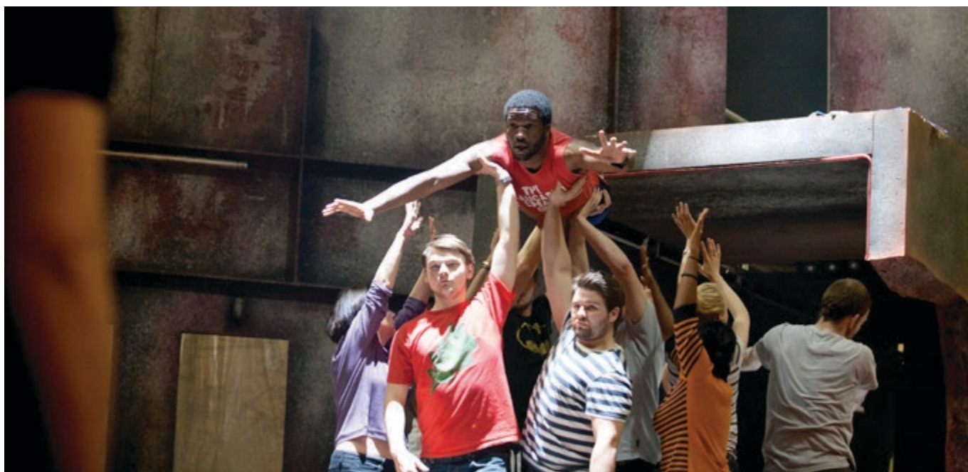
Pericles at the RSC (2012)