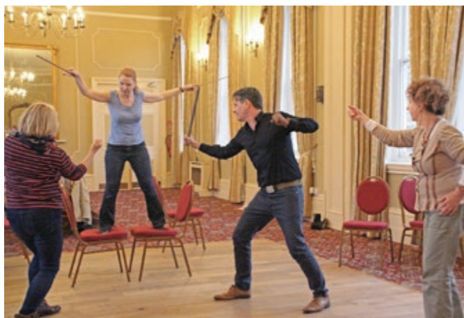
Shakespeare at the George rehearses The Tempest in Huntingdon (2016).