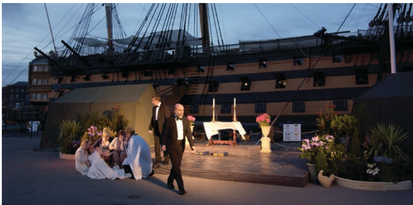
The Royal Navy Theatre Association's Much Ado About Nothing performed in front of the HMS Victory in Portsmouth (2012).