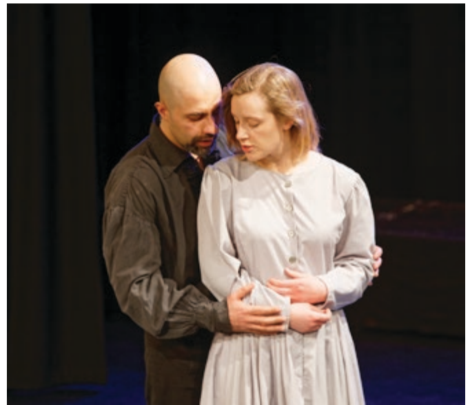
Measure for Measure at Everyman Theatre in Cardiff (2015)