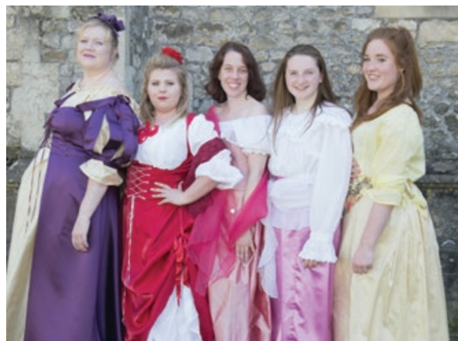
Taming of the Shrew at Athanaeum Limelight Players in Warminster (2016)