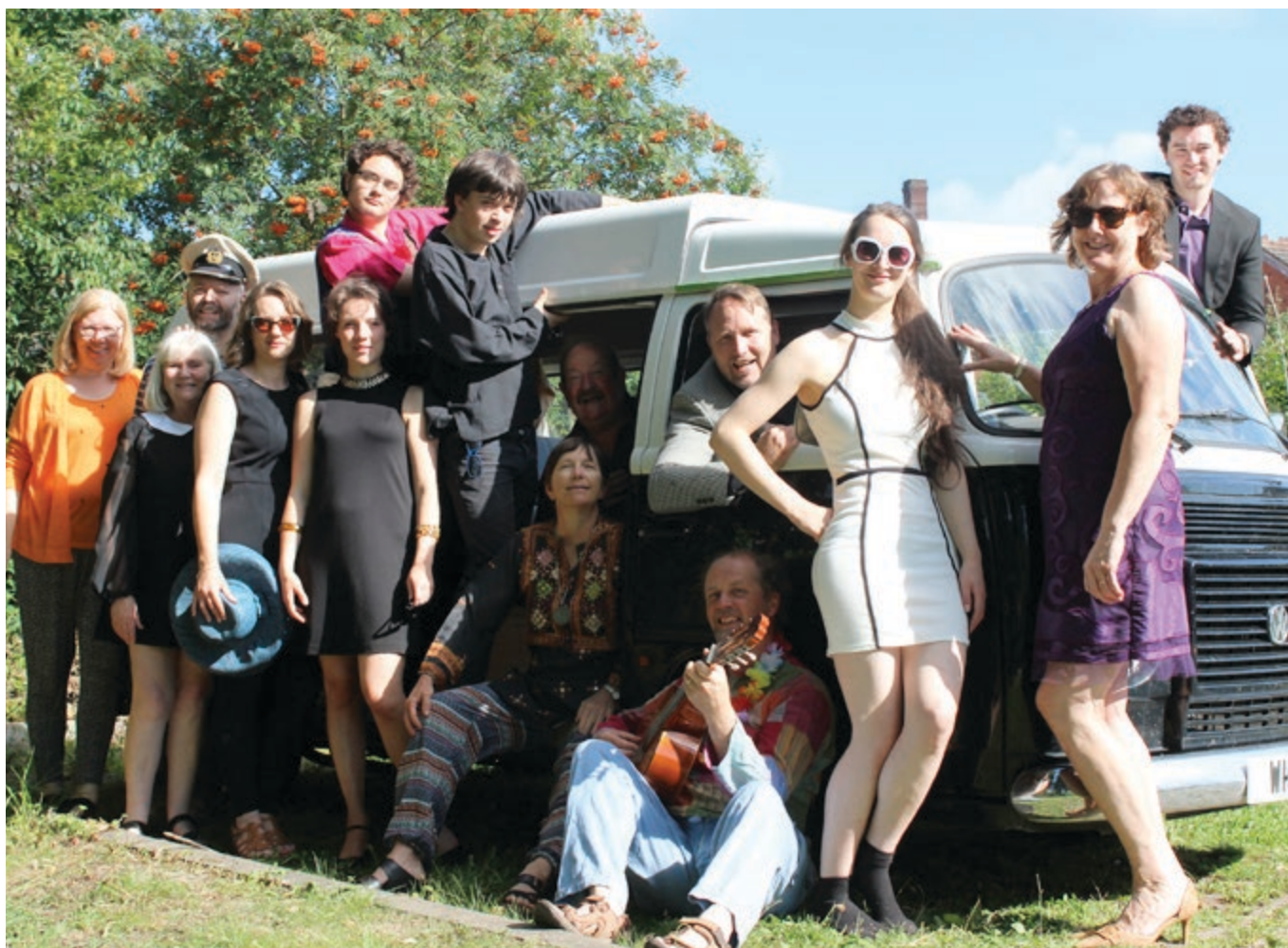
Twelfth Night at Llanymech Amateur Dramatics Society (2016)