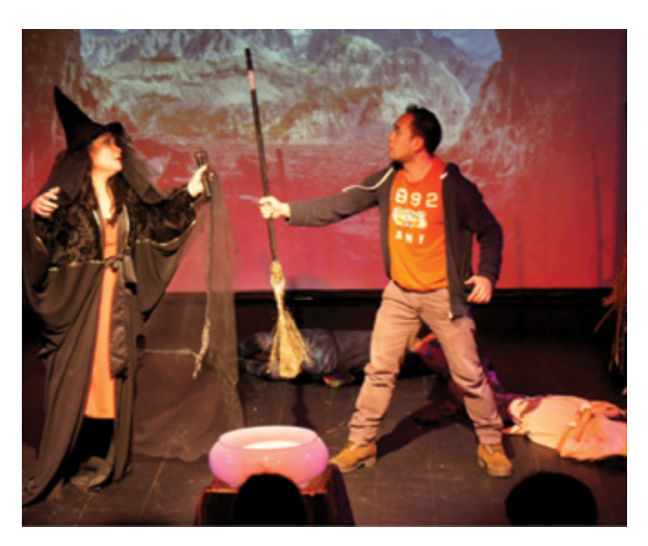
The Enchanted Bird, The Philippine Theatre UK.

This can last for generations. For example, when we reenacted Letchworth's Second Garden City Pantomime (1911) with the current cast, the process shed light on contemporary cultural policy in the city. The pantomime satirised the 'artyparty' who wanted to impose 'high art' on local people in 1910, a position that still resonated with amateur actors in 2014. Other productions directly engage with cultural heritage through the use of specific stories, histories and places. The Philippine Theatre UK's The Enchanted Bird (2014) adapted a classic Filipino folktale.