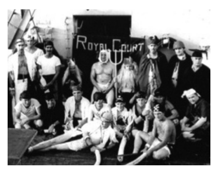
Crossing the Line ritual

Sometimes heritage is intangible, and remains undocumented. This is the heritage that resides in the collective memories of participants. In the Royal Navy, for example, there are performance rituals such as crossing the line ceremonies at the Equator, as well as songs and SODs operas that sailors remember performing on board ship.