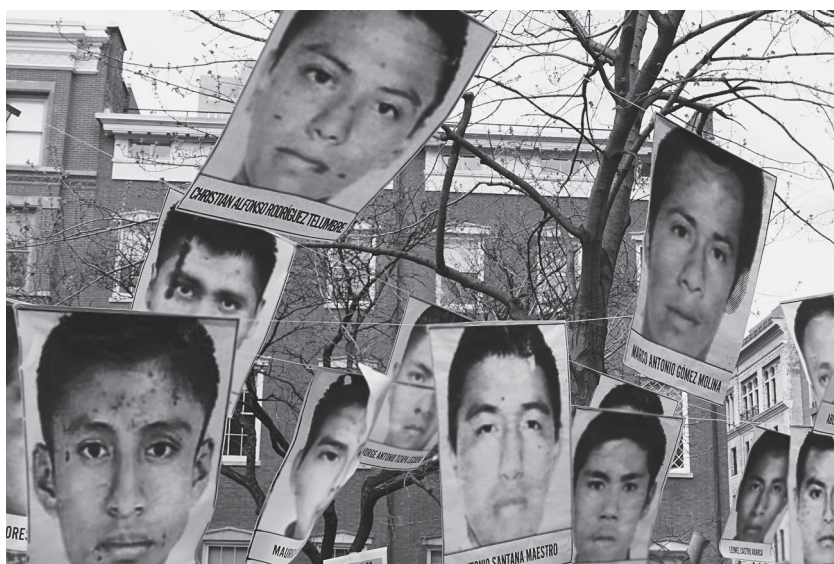
Figure 6.1 “Photos of the 43 in Washington Square Park,” New York City. April 2015.

repressive technology.” 27 Disappearance, he continues, “is not an event but a process, an assemblage of actions, omissions, confusions, in which many agents participate.” 28 So those shouting “ Fue el Estado ” were right even if the president did not order the killings, tortures, and disappearances. It was the state, from the president on down, that created the “disappeared” by allowing all evidence to go missing and by threatening those who searched for facts. Those involved in the functioning of disappearance include social actors from the military and security forces, the executive branch, the judiciary, the technicians who handle evidence, the bureaucrats responsible for filing documents, the compliant members of the media, and on and on. The politics of death—what Achilles Mbembe has termed “necropolitics”—and permanent states of exception during which people can be tortured, assassinated, and disappeared, dominate contemporary Latin American “democracies” just as they did during the U.S.-backed military dictatorships of the 1970s and 1980s. 29 And just as in that period, the Madres of Plaza de Mayo cried, “ ¡Vivos se los llevaron, vivos los queremos! ” today the mothers, fathers, and family members of the 43 give voice to their protests in the same way.