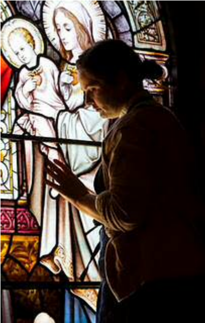
Laundry (Anu Productions, 2011). Girl by the stained glass window

Finally she gestures towards the Church and I move in that direction. There is a walkway from the corridor to the chapel and it is covered in (human) hair which is silky under my fingers. As I move onto this walkway a young woman approaches me and asks if I can hear her baby crying; I can. She brings me to a wall with a peep-hole drilled into it, whispering to me to look through. I see a windowless room full of empty cradles. She asks if I can see her baby; she can hear him crying. Turning back into the church, she brings me along by the hand. Inside the doorway is a stained glass window set in a large alcove. Taking up a bundle of sheets, she climbs into the alcove and mimics the Virgin in the image, clutching the sheet to her breast in place of her missing baby.