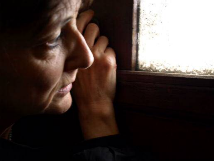
Laundry (Anu Productions, 2011). The widow's story

asks if she can hold my hand. I take a sweet and say yes, she can hold my hand. The warmth of her hand and the sweetness of the candy give me some comfort. The character tells me that she left the Laundry to marry but that after her husband died she asked to re-enter, because she was afraid to be on her own. She describes her fear, alone in the house at night. Her life is difficult, she says, but in the Convent she will always be remembered and prayed for, won't she? I say yes, she will. I don't reply that she will likely be buried, unrecorded, in a mass grave. She tells me to go into the Confessional on the other side of the Chapel and I cross to it and enter one of the doors.