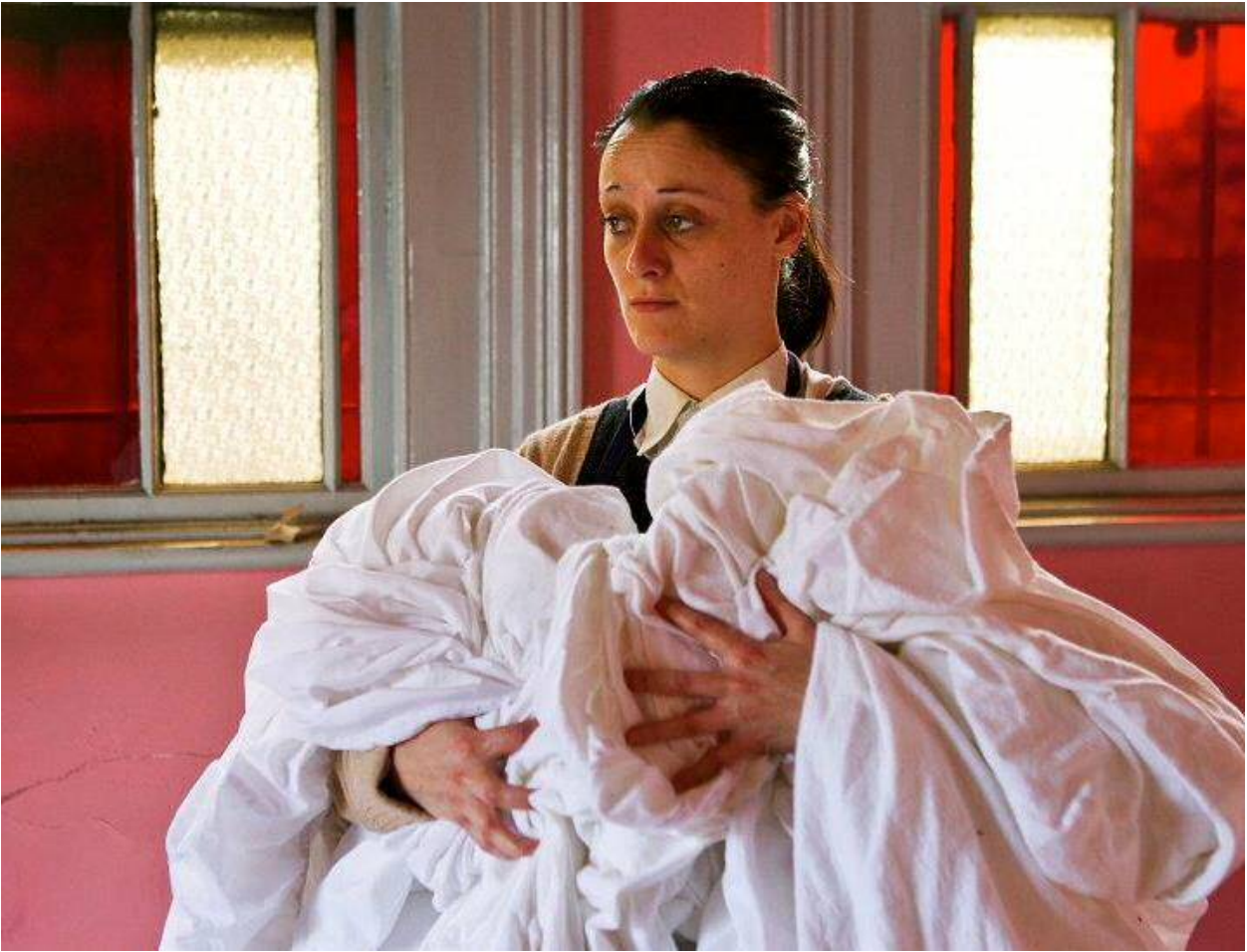
Laundry (Anu Productions, 2011). The escaping girl, carrying sheets

In the street the girl pushes me into a waiting taxi, with my sheets. She hurries away across the road and my attention is diverted by my driver. He is also an actor, and he drives me around the block while he offers a potted history of the neighbourhood. He drops me, with my sheets, at a local laundrette where I work with the other two spectators who entered with me, and hear stories of the laundry. After a while, the taxi returns and brings us back to the front of the Convent building. We are each presented with a bar of carbolic soap wrapped in brown paper, with our names and the date on it (Fig 1). Then we are released back onto the street, back into the centre of the city.