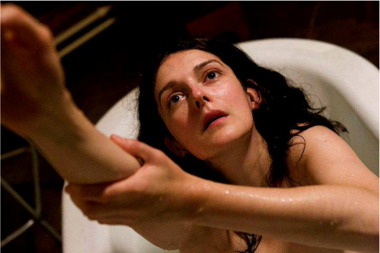
Laundry (Anu Productions, 2011). The girl in the bath.

Inside this room is a tin bath. A heavily pregnant girl, the one who summoned me, sits on a chair and watches impassively as a young woman with bandaged breasts unfastens the cloth wrapping and indicates that I should hold it. Naked, she steps into the tin bath and sits, shivering. Beyond the room a baby howls and her body convulses in response. The room is full of the buckets of whitish liquid that I have been told before was breast milk. Women in the Laundries often developed mastitis but were denied medical attention. The young woman emerges from the bath and gestures to me to hold the cloth, and she winds her body until she is bound once more. I do not know what to do.