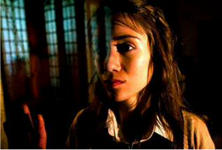
Laundry (Anu Productions, 2011). The young woman in the mirror

Finally she gestures towards the Church and I move in that direction. There is a walkway from the corridor to the chapel and it is covered in (human) hair which is silky under my fingers. As I move onto this walkway a young woman approaches me and asks if I can hear her baby crying; I can. She brings me to a wall with a peep-hole drilled into it, whispering to me to look through. I see a windowless room full of empty cradles. She asks if I can see her baby; she can hear him crying. Turning back into the church, she brings me along by the hand. Inside the doorway is a stained glass window set in a large alcove. Taking up a bundle of sheets, she climbs into the alcove and mimics the Virgin in the image, clutching the sheet to her breast in place of her missing baby.