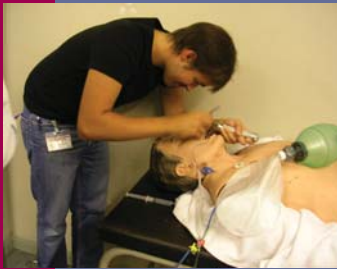
p6 Student news – Trauma medicine & the pros and cons of becoming a GP.

► This year the University of Warwick celebrates its 40th Anniversary. Warwick Medical School has an important part to play in the celebrations, particularly given the parallels between us and our parent university.