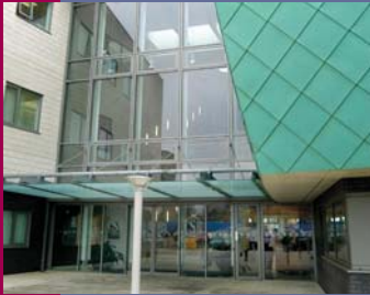
p3 Landmark – Research at Warwick Medical School takes off.