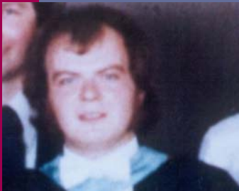
p5 Graduate viewpoint – two Leicester graduates who came and stayed on.