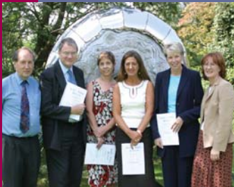
p4 Working together – Inter-Professional Education.