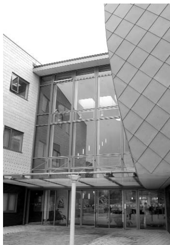
The Clinical Sciences Research Institute on the University Hospitals Coventry and Warwickshire NHS Trust site.