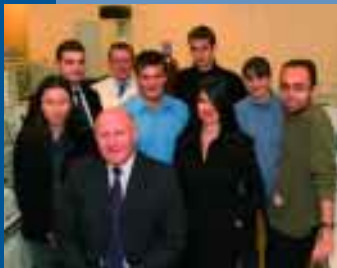
p3 Young Scientist of the Year