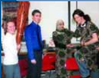
p4 Global Health Module at Warwick