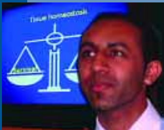
p6 International Student Congress