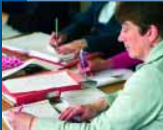
p2 Success of Minor Injuries Course