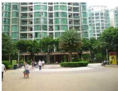
Figure 4 - High-rise units of Yi Jing Cui Yuan Housing area, Guangzhou, China