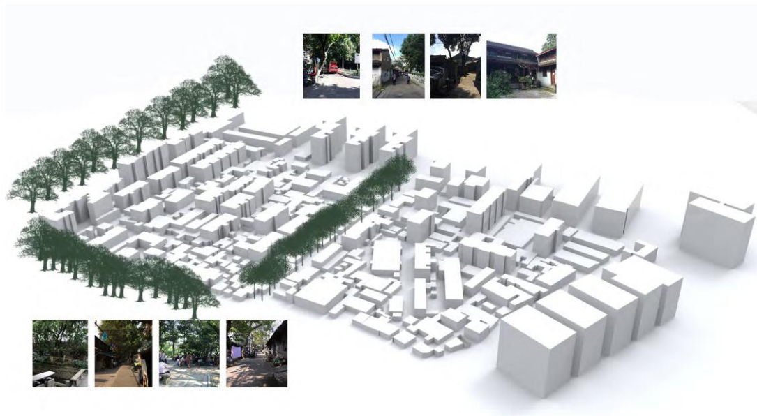
Figure 1 – Approximate setting of the Xiushui District, Central Ningbo, China

this traditional residential district includes around 2,700 housing units, a combination of both formal and informal buildings. The overall population of the area is estimated 7,000 people, with around 4,700 as non-permanent (i.e. rural migrants) or non-native residents. This housing area is a typical ageing community with at least 1,800 elderly. The whole area has about 2,000 registered residents, providing us the fact that this area includes many low-income rural workers. The whole area is comprised of houses, commercial streets, communal spaces and on-street markets. Such housing pattern is vanishing from China's urban landscapes as such communities are in long-term deprivation. Although very liveable and planned in a mixed-use setting with sufficient access to nearby areas, there are no inner green landscaping and facilities for the residents.