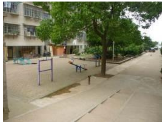
Figure 2 – Typical housing unit of BianZhouWei Area, Changsha, Hunan