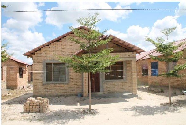
Fig. 3a. Full house under construction

This option proved preferable and many opted to construct their houses in this way. Few members who were not in a serious need of housing continued to construct full houses (Refer figure 3a and 3b). Only seven full houses were completed at the time of conducting this study. With a reduced scope of work (i.e. erecting only two rooms and a toilet) the second imbursement enabled the work to progress to roofing stage. At this stage of construction a further injection of One Million Five Hundred Thousand Tanzania Shillings enabled the two rooms to be fixed with door and window frames (and later door shutters), internal wall plaster, floor screed, pointing externally, fitting sanitary appliances in toilet, connecting soil waste to sewer line and cleaning of the environments ready for habitation. This finishing cost was borne by beneficiary themselves with an assistance from the Co-operative Society collections.