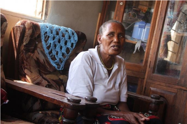
Fig. 4b. One of members in her new sitting room

An on-site personal observation also finds a water-well which is fitted with a solar powered submersible pump. Temporally site office/storage, market building, and the roof tiles making shed are among the features that can be seen on the site, the rest is a clear virgin land that awaits development. This housing development is connected by a 2.0 kilometer earth road stretching to the main road at Chamazi-Magengeni also it has an electrical service line constructed by TANESCO. The housing estate has services of commuter buses which plies from Mbagala-Rangi tatu to Dovywa kwa Mapunda.