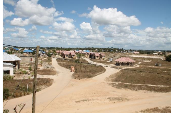
Fig. 5 Extent of development of the housing estate