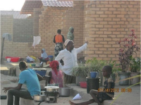
Fig. 4a. Members in their new residence

The place will be even more vibrant when all member houses will completed and occupied. The houses are well arranged and properly connected with road network making them easily accessible from different directions. Generally the houses are satisfactory in terms of quality, suitability and adequacy and members are optimistic with the low cost housing provision by their co-operative. It is a dream come true to MHCS members and an eye opener to many who happen to see these achievements.