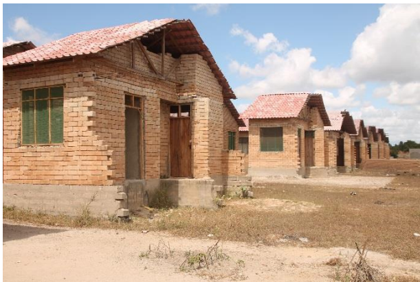
Fig. 2a. Two room development

In order to ease life to these low income earners, MHCS board decided to give options in favor of those who were in critical need of housing. The board came up with an idea of erecting two rooms and a toilet only (incremental mode) to a habitable state ready for the needy ones to shift in, the other two rooms and an entrance porch were left to be completed when the financial clot allows. (Refer figure 2a and 2b).