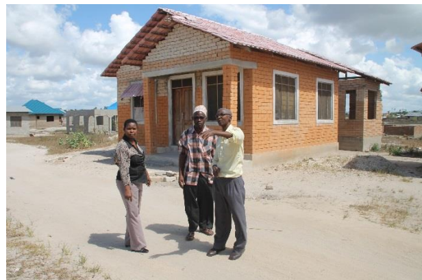
Fig. 3b Completed full house

While construction was progressing on these ten houses, MHCS Board had started negotiations with SDI to see into the possibility of financing another batch of twenty houses. The financier agreed and the same technicalities of disbursing the funds and injecting the money in construction work started. So at the time the first ten houses were at an advanced stage of wall construction the other batch of twenty houses started. Satisfactory work progress at site enhanced good work relationship between the Housing Co-operative and SDI such that by mid-2011 the later had indorsed finance for starting construction of another batch of eleven houses making the total number of houses at the time of conducting this study to be forty one.