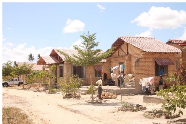
Fig. 2b. Life in two room development