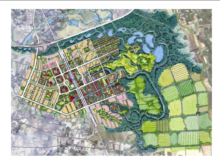
Fig. 2 Ecocity Tainan, Masterplan by GAIA International with Joachim Eble, Varis Bokalders and C hris Butters, in collaboration with EDS Design Services, Archilife Foundation and Tainan County g overnment, 2005-07.

GAIA redefined the boundaries for the city, to include the surrounding countryside. In this way many resource flows can be optimised and integrated. The layout of streets and typology of building masses is based on bioclimatic principles. Priority is on energy efficiency, reduced traffic, water recycling and green corridors. These passive design strategies reduce resource needs before selecting the supply side solutions. Features such as green corridors reaching into the city fulfil specific microclimatic functions. Similarly, street orientation and geometry is not simply aesthetic design but optimises solar orientation, shade, wind and urban ventilation – providing an improved cooler microclimate. Climate and ecology thus become key generators of urban form. The city is zoned into four areas of different character and density, to integrate workplaces and illustrating that sustainable typologies can range from dense city blocks to low-density garden suburbs, plus rural villages. A major obstacle to urban sustainability is the private car. This is not just about fuel use but about liveable, child friendly streets and healthy, noise-free outdoor spaces. Much of the land around this eco-city is used for a struggling sugar cane industry. This is ideal for developing biofuels since it would not compete with food production. It could quite literally become the petrol station for the city – local and renewable biofuels.