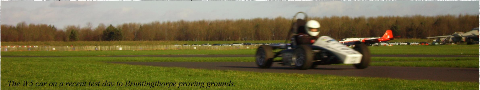
The W5 car on a recent test day to Bruntingthorpe proving grounds.

The team has started an official development program in preparation for the Formula Student event in July at Silverstone. With a shortlist of drivers now selected for the event testing will focus on dynamic handling and car setup. Video from a recent test day can be found at www.formulastudent.warwick.ac.uk .