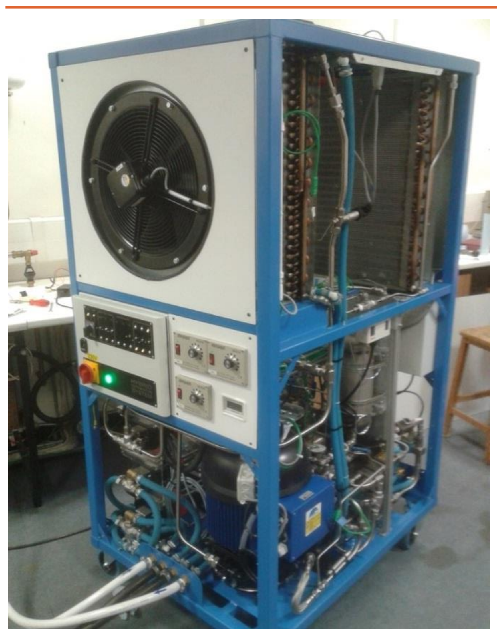
8 kW cooling capacity prototype

This is a research project funded by EPSRC (EP/J000876/1) aimed to develop a novel hybrid refrigeration and heat pump system. The hybrid system uses an environmentally friendly refrigerant as R723 (azeotropic mixture: 40% DME and 60% Ammonia) The system combines both adsorption and conventional vapour compression refrigeration. The proposed cooling system is driven by dual source (heat and/or electricity) and offers high flexibility and potential energy saving.