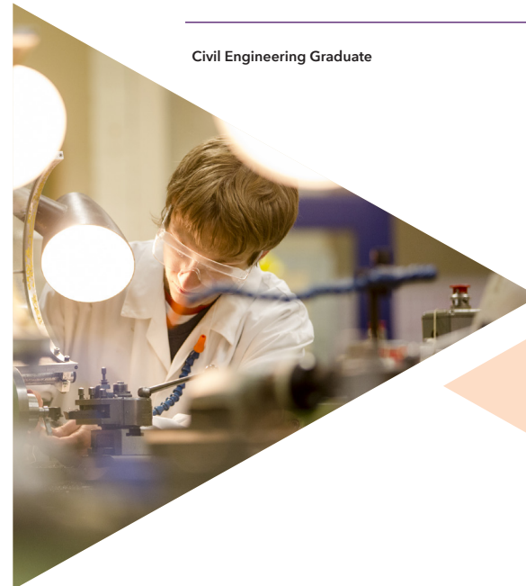
Civil Engineering Graduate

As society develops, engineers are called upon to create a better, more sustainable world.