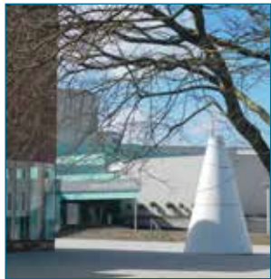
67. Warwick Arts Centre

CV4 8UW directs you to Kirby Corner Road where Arden is signposted.