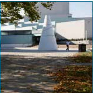
56. New Conference Reception for 2013