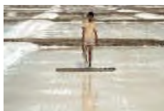
A labourer works on a saltpan in Mumbai April 13, 2006. Governments around the world could save huge health costs and avert millions of early deaths if they introduced laws to cut salt levels in food, a top World Health Organisation (WHO) nutrition adviser said on Tuesday.