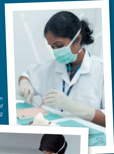
Surgery class on knotting and suturing