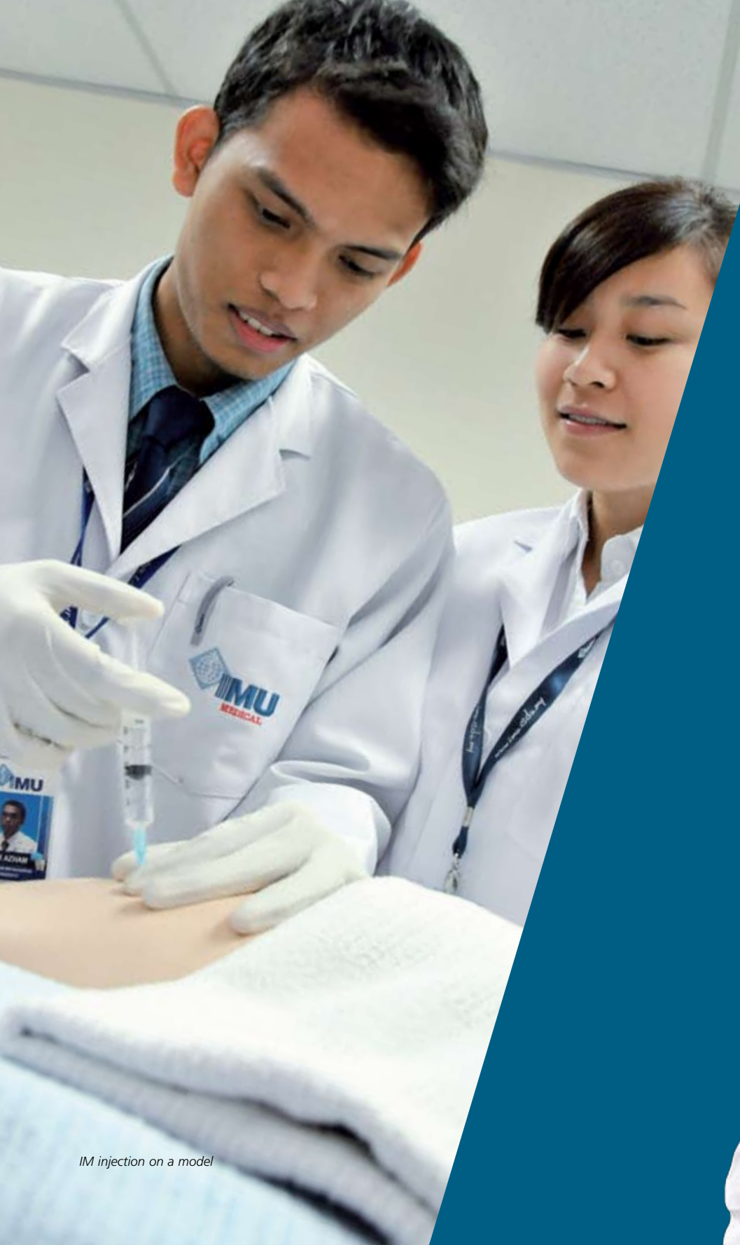
IM injection on a model

“IMU provides a holistic 360 degree learning experience which allows us to become caring doctors and reflective medical practitioners of the future.”