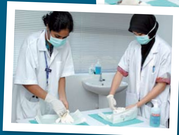
Student practising "open gloving" in Skills Unit