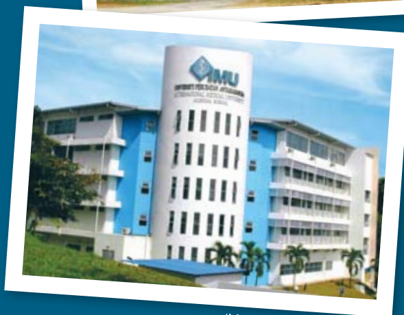
IMU Clinical School, Seremban