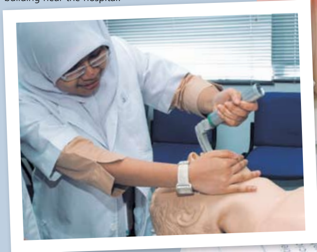
Learning how to use the laryngoscope on a model