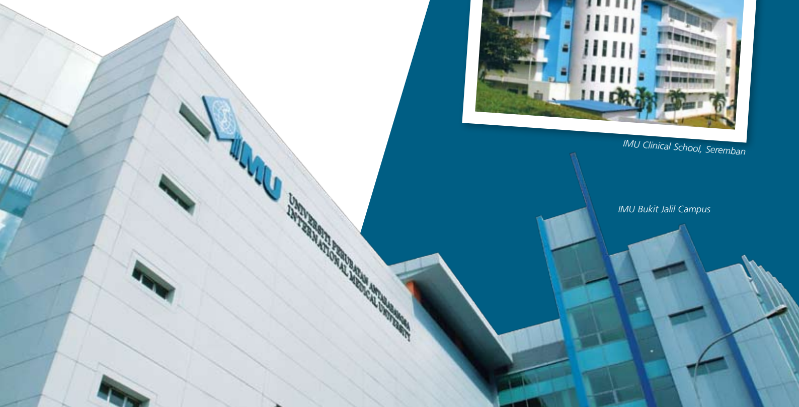
IMU Bukit Jalil Campus