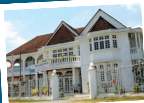
IMU Clinical School, Batu Pahat

Since 1999, the University's growth and development has been in developing clinical schools in Seremban and Batu Pahat, our own Honours degree courses in Pharmacy and Nursing, and in establishing research as a core activity, together with development of postgraduate research Masters and PhD programmes. We are already the preferred private school for medicine and pharmacy in Malaysia. Our growth has been supported by heavy investment in infrastructure development and expansion at Bukit Jalil and Seremban, and in the recruitment of staff of high calibre. In 2008, we have introduced Honours degree courses in Dentistry, Nutrition & Dietetics, Medical Biotechnology, Psychology, Biomedical Science and in Pharmaceutical Chemistry. In common with our MBBS, BPharm and BNursing, these courses have been designed from first principles by our faculty. Bachelor of Nursing Science (Hons) was introduced in 2009, a programme targeted solely for registered nurses to upgrade their qualification from diploma level to a degree level. In 2010, we introduced Chiropractic programme, the first of its kind and only complete educational programme in Malaysia as well as in all of Southeast Asia. In addition, the Chinese Medicine will be launched in February 2011. We believe our courses to be progressive and innovative, and we strive to use best practice in their delivery and assessment.