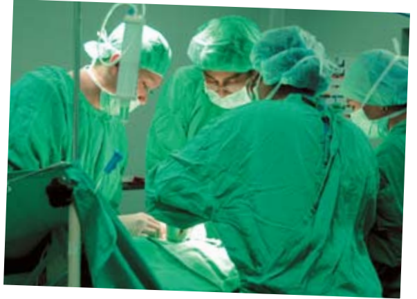
Students assisting in the operation theatre

Students, including non-Malaysians who graduate with the MBBS (IMU), can undertake their housemanship in Malaysia.