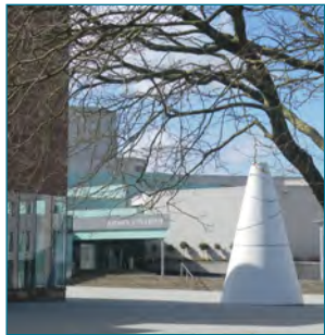
66. Warwick Arts Centre

CV4 8UW directs you to Kirby Corner Road where Arden is signposted.