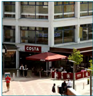
53. Roots Building, Conference Park