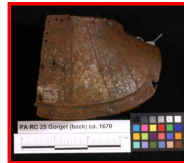
PA RC 25 Gorget