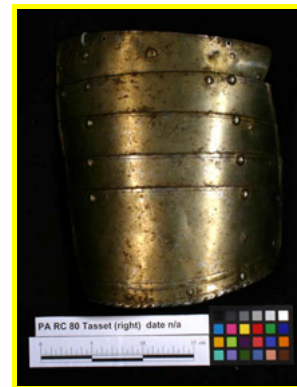
PA RC 80 Tasset

Amour outlined in red were not selected for further surface study, amour outlined in yellow were selected for surface study only and amour outlined in green were selected for surface and cross-section studies 1