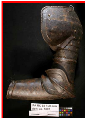
PA RC 88 Full arm