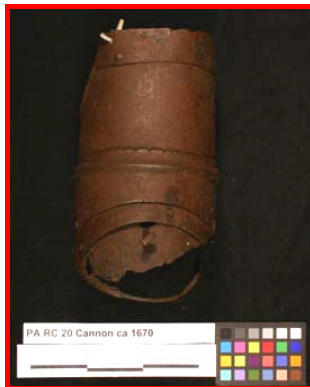
PA RC 20 Cannon