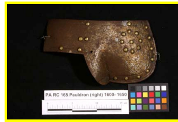
PA RC 165 Pauldron (part)