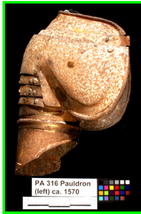
PA 316 Pauldron