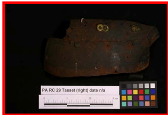
PA RC 29 Tasset