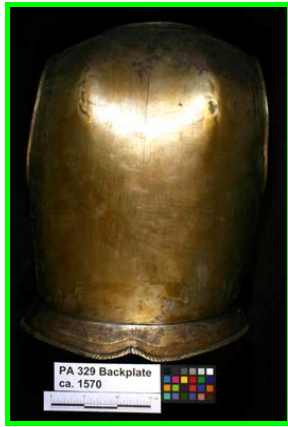
PA 329 Backplate