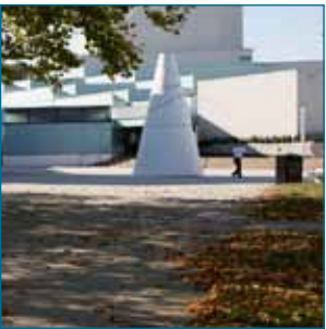
56. New Conference Reception for 2013