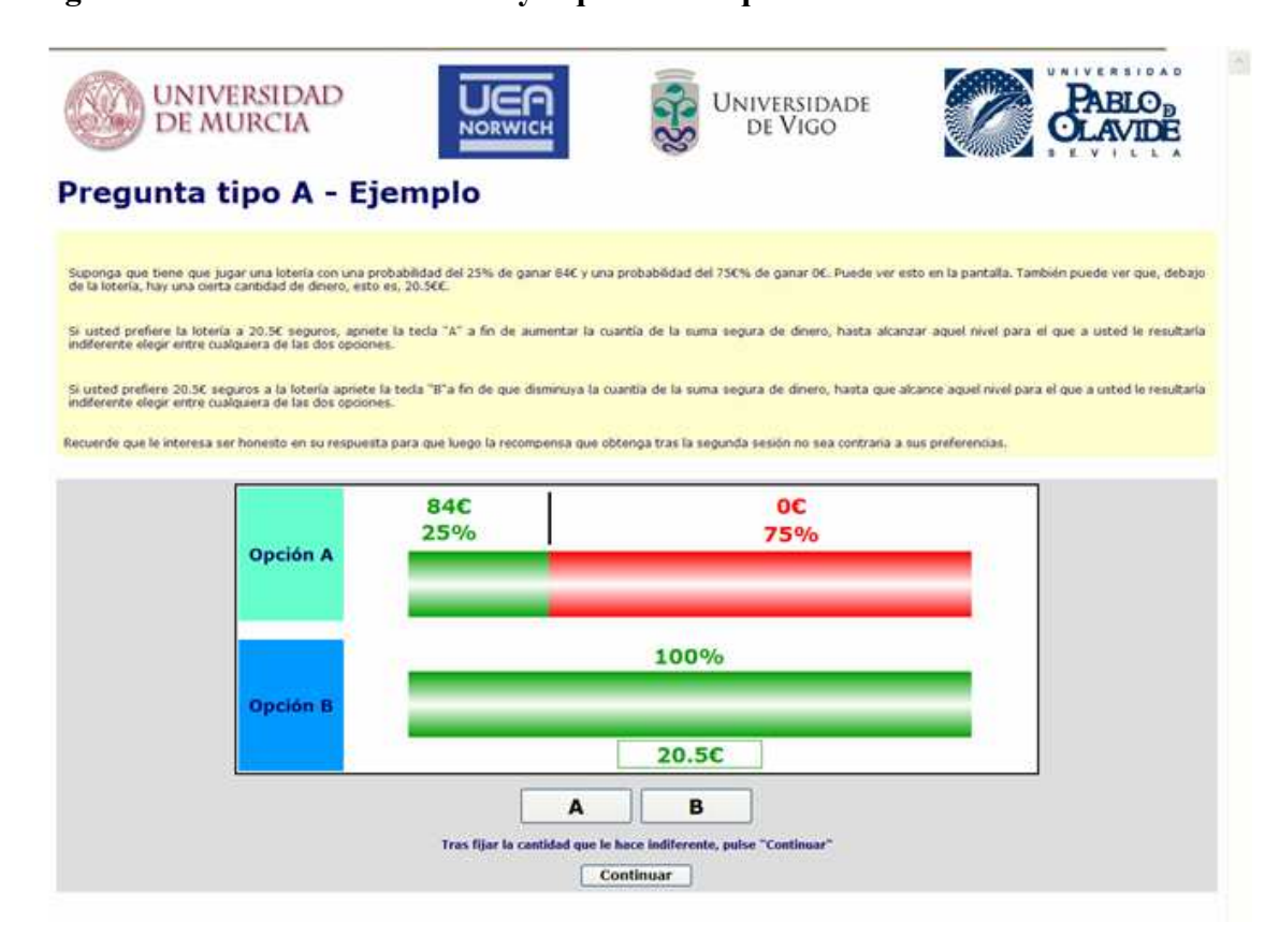
Figure A1: Screenshot of a Money Equivalence question

For each alternative, the bar was divided in proportion to the probability attached to the relevant payoff. For Option A (the lottery) the chance of winning the higher outcome (€84 in the example) was always coloured in green. The lower outcome (€0 in the example) was in red. As Option B only offered one sure amount, the entire bar was in green. Participants were asked to press "A" or "B" buttons until they considered both options equally attractive in terms of their preferences. Whenever the "A" button was pressed, the sure sum of money was increased, making Option B more desirable. The reverse occurred when subjects pressed the "B" button. Once subjects felt that they were indifferent between the two options, they registered this and moved on to the next question by pressing the "Continue" button.