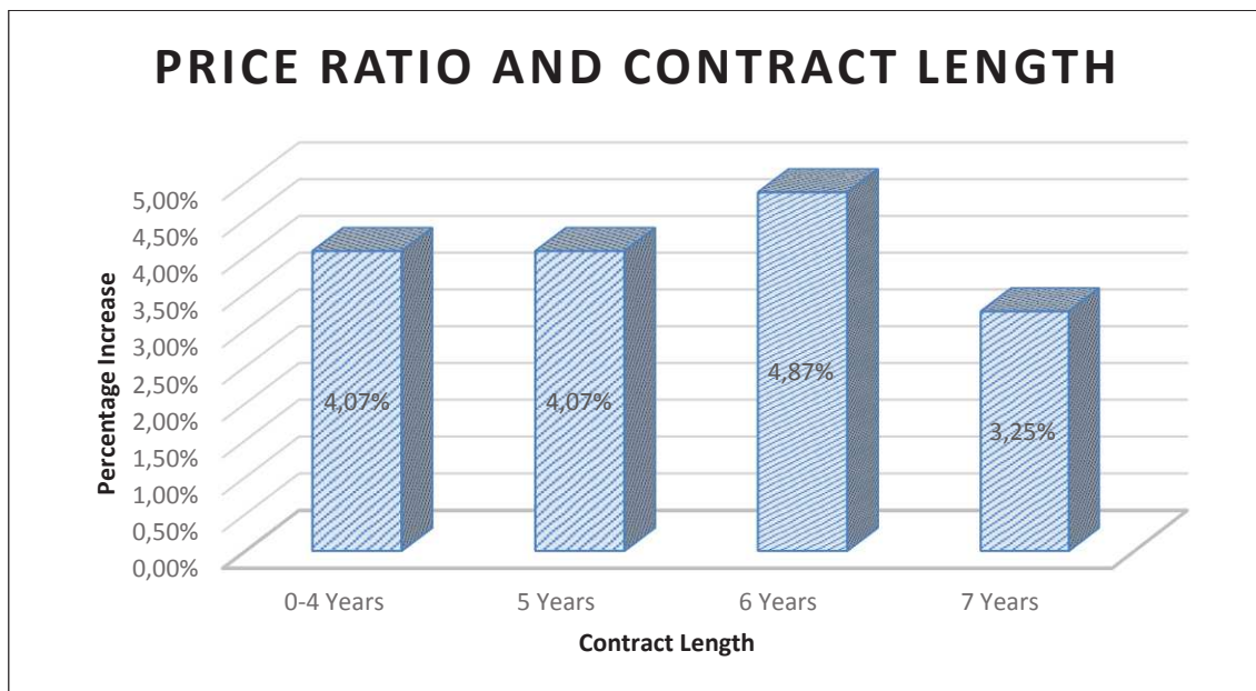
Figure 2: Price Ratio and Contract Duration