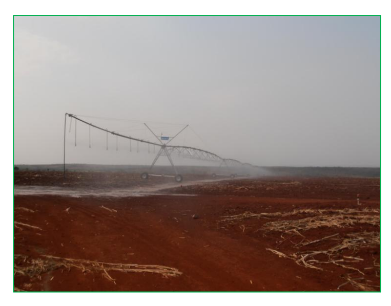
Is the 'water grab' even more important than the 'land grab'?

The existence of poor planning is further supported in the complaints by the Gamba Manyatta residents that since they have been relocated, they have been "forced to consume stagnant water from the TARDA outlet trench...which water chemicals from agricultural fields".45 Taken together, these two problems doubt on the ability government authorities to ensure that people's access to safe drinking water is not jeopardised by the introduction of thirsty crops like sugarcane to the area.