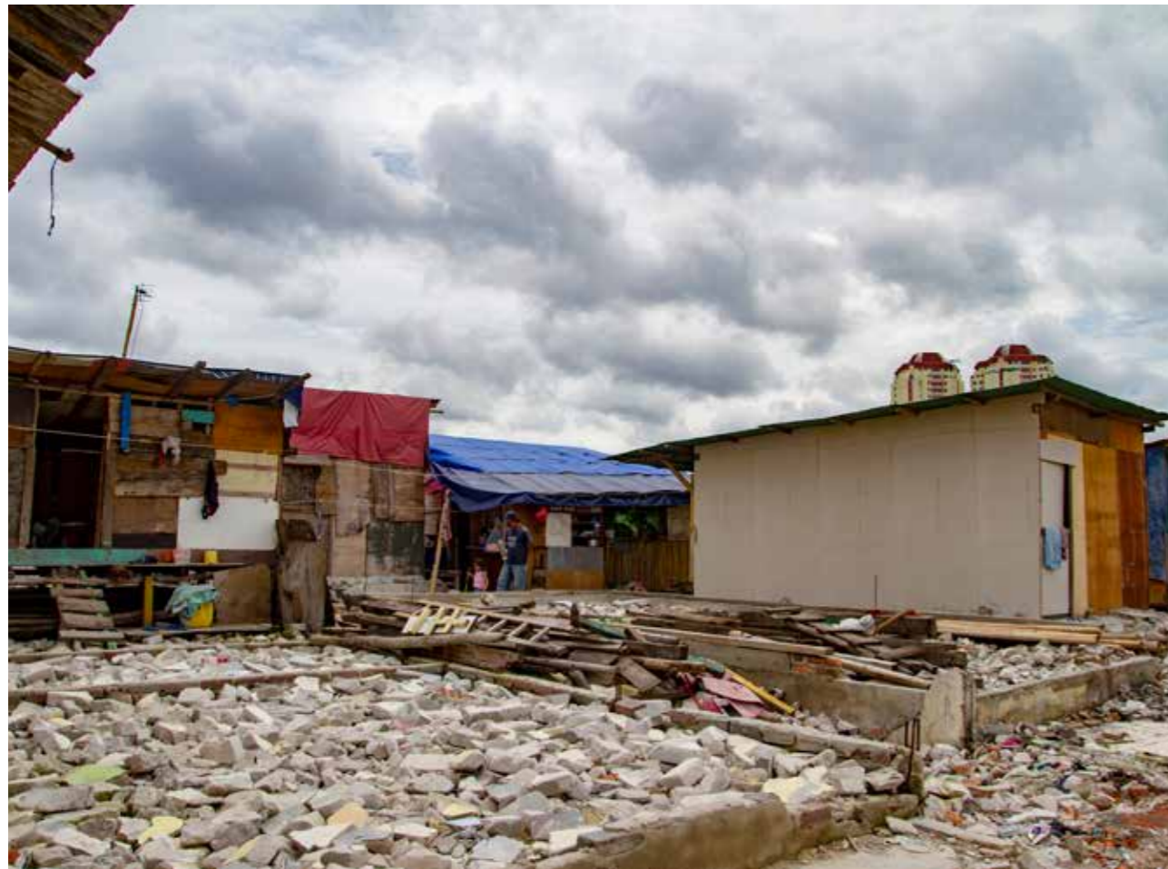
Temporary homes being rebuilt by evicted residents on the rubble of Kampung Aquarium

The eviction process happened extremely quickly. The first warning of eviction came at eight o'clock in the evening, and they refused to take the letter. The second came 10 days later and was delivered in the morning. The third warning letter was glued to their wall and they were given one week to