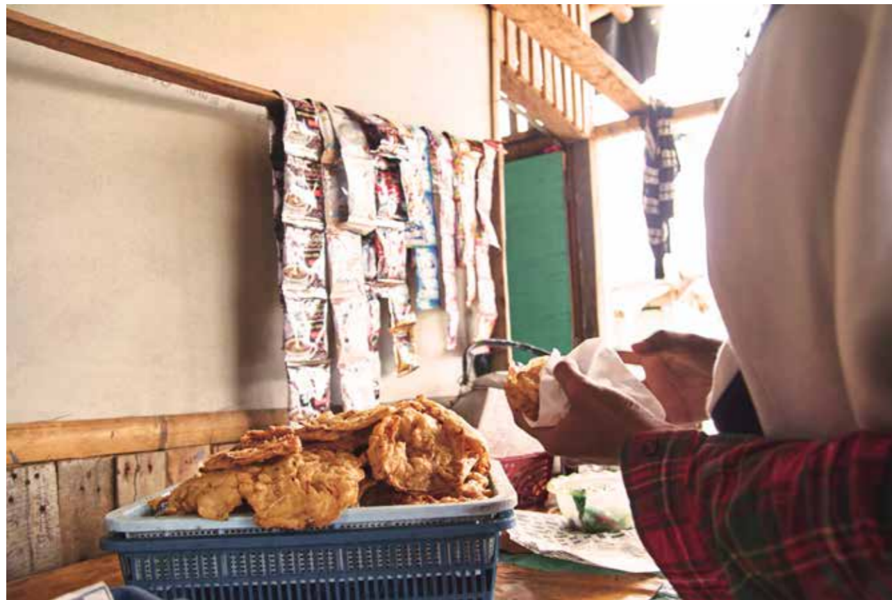
A mother keen to stay close to her daughter's school runs a small warung selling meals and snacks inside the rebuilt family shelter in Kampung Akuarium.