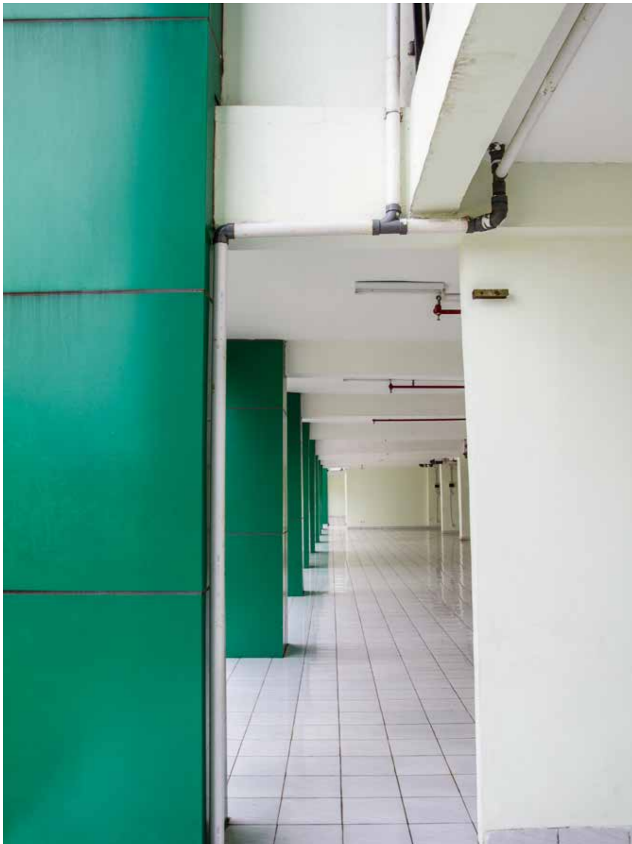
Interior detail Rawa Bebek public housing.