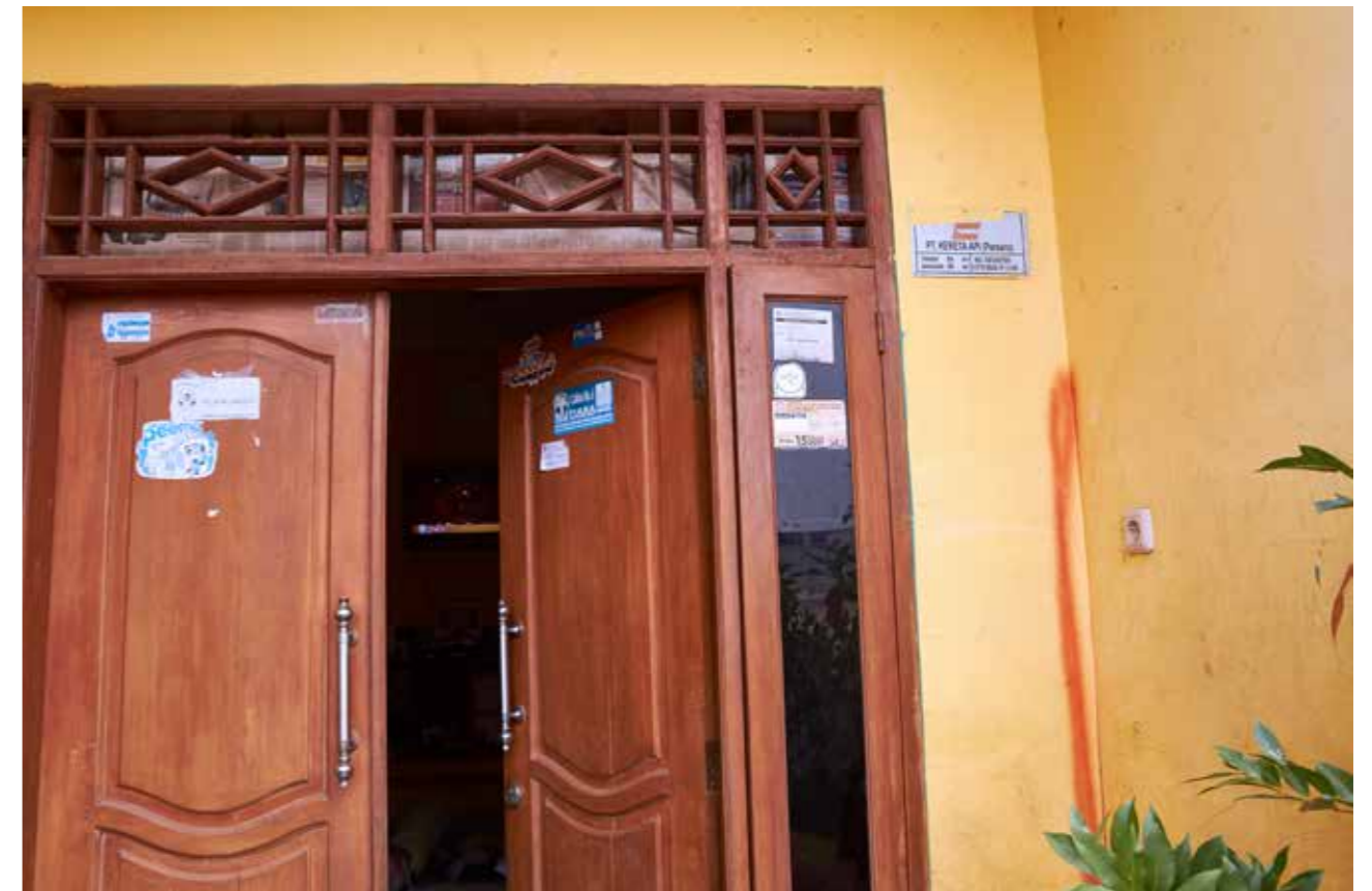
A home in Bukit Duri that was marked with red paint for demolition, but survived the eviction.