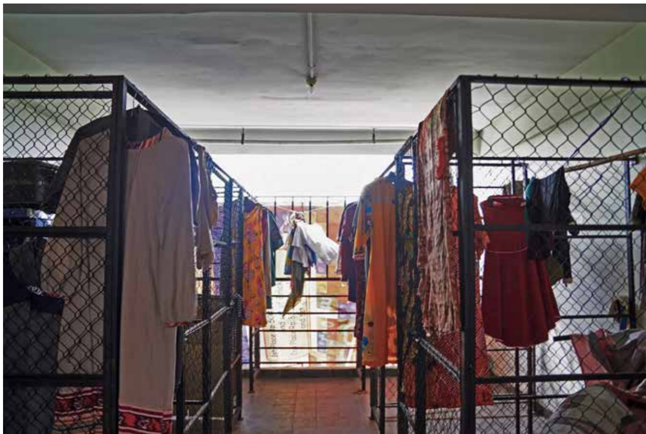
Residents in Rawa Bebek are provided with small lockable cages in which they can dry clothes, prepare food and store belongings

She had previously sold coffee, juice and iced drinks from her home, but now has few customers since the evictions took place. Before the eviction, she was given three warning letters in the space