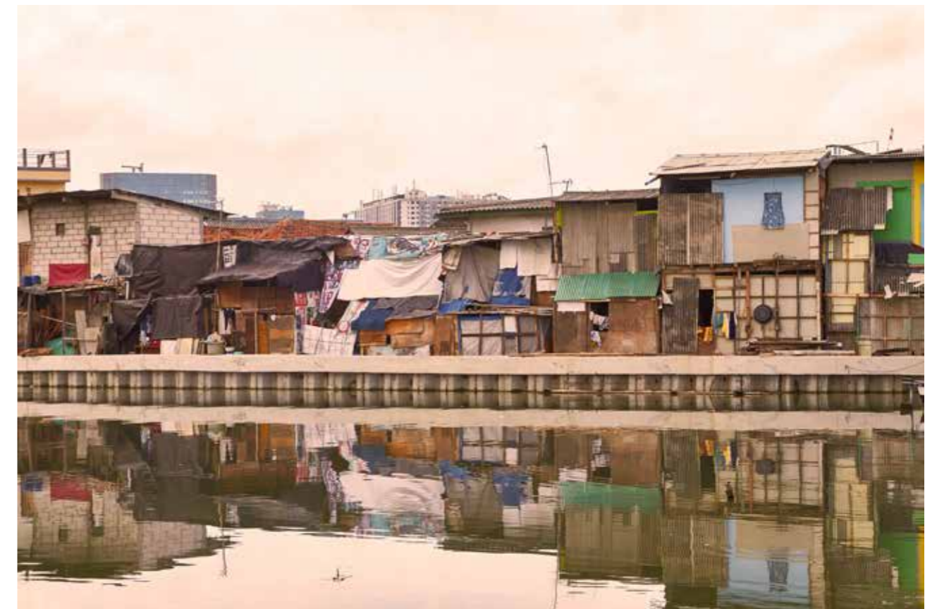
The back of Kampung Luar Batang viewed from Pasar Ikan across the water.