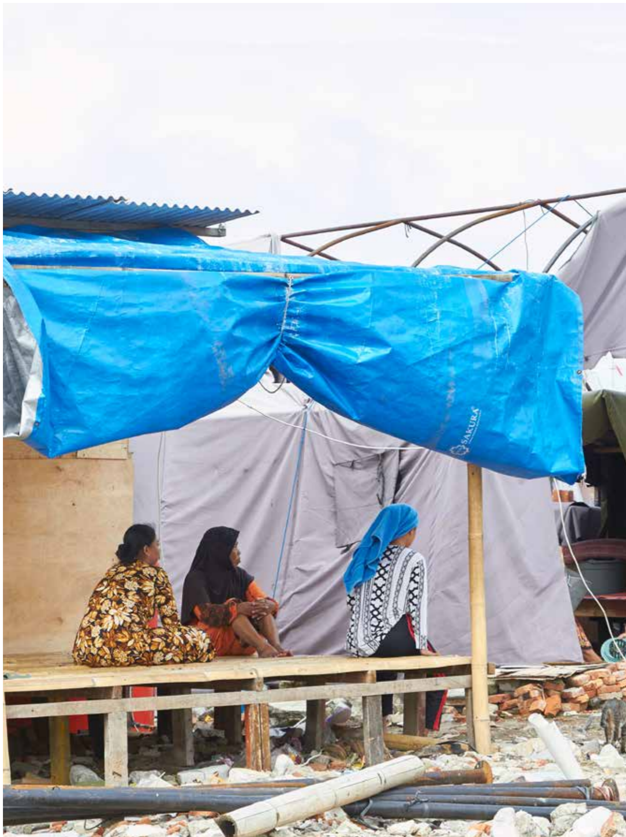
Kampung Aquarium. Shelters built on the eviction site.