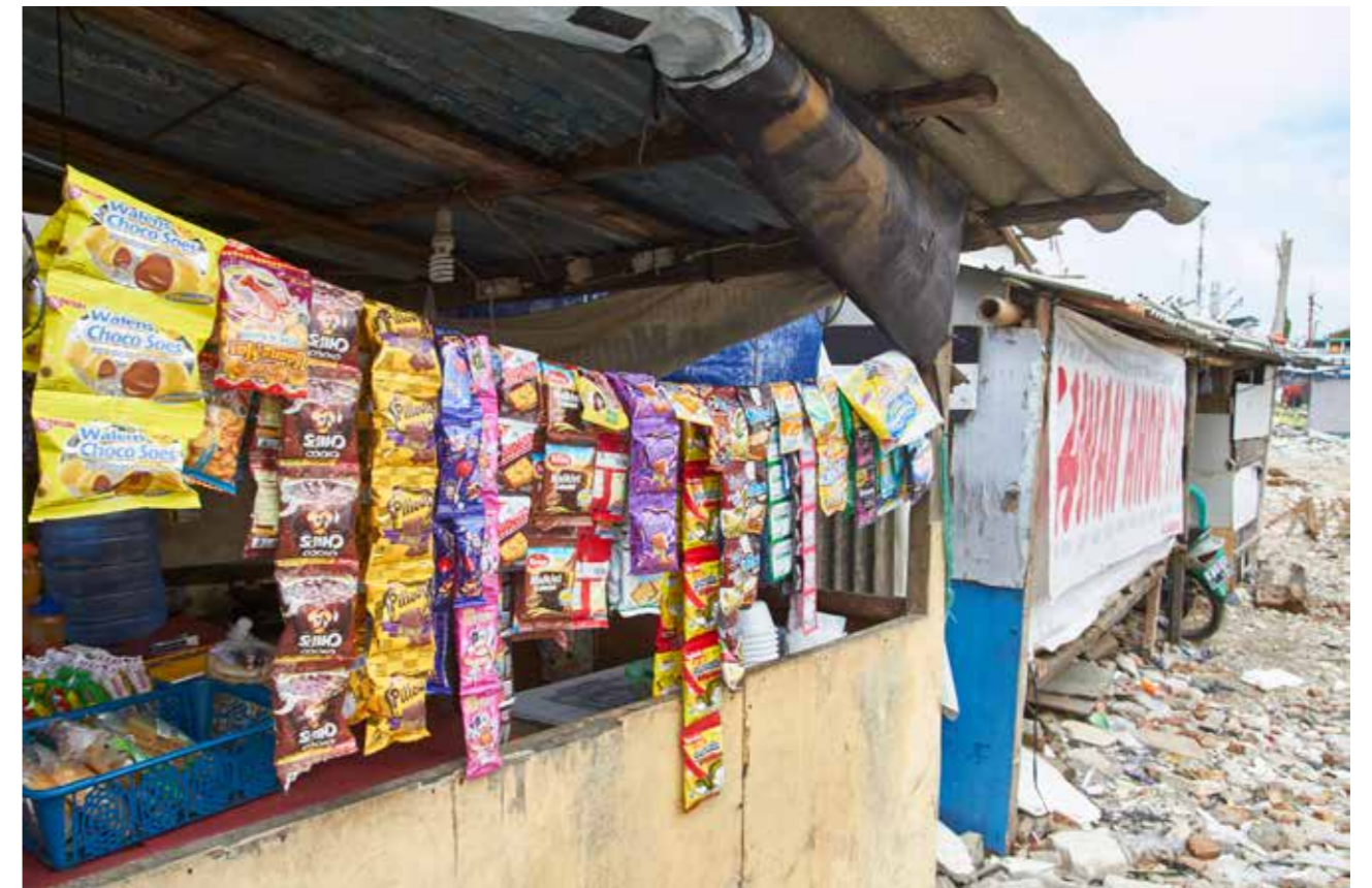
Kampung Aquarium. Stalls selling food and drinks re-established by residents occupying the site.