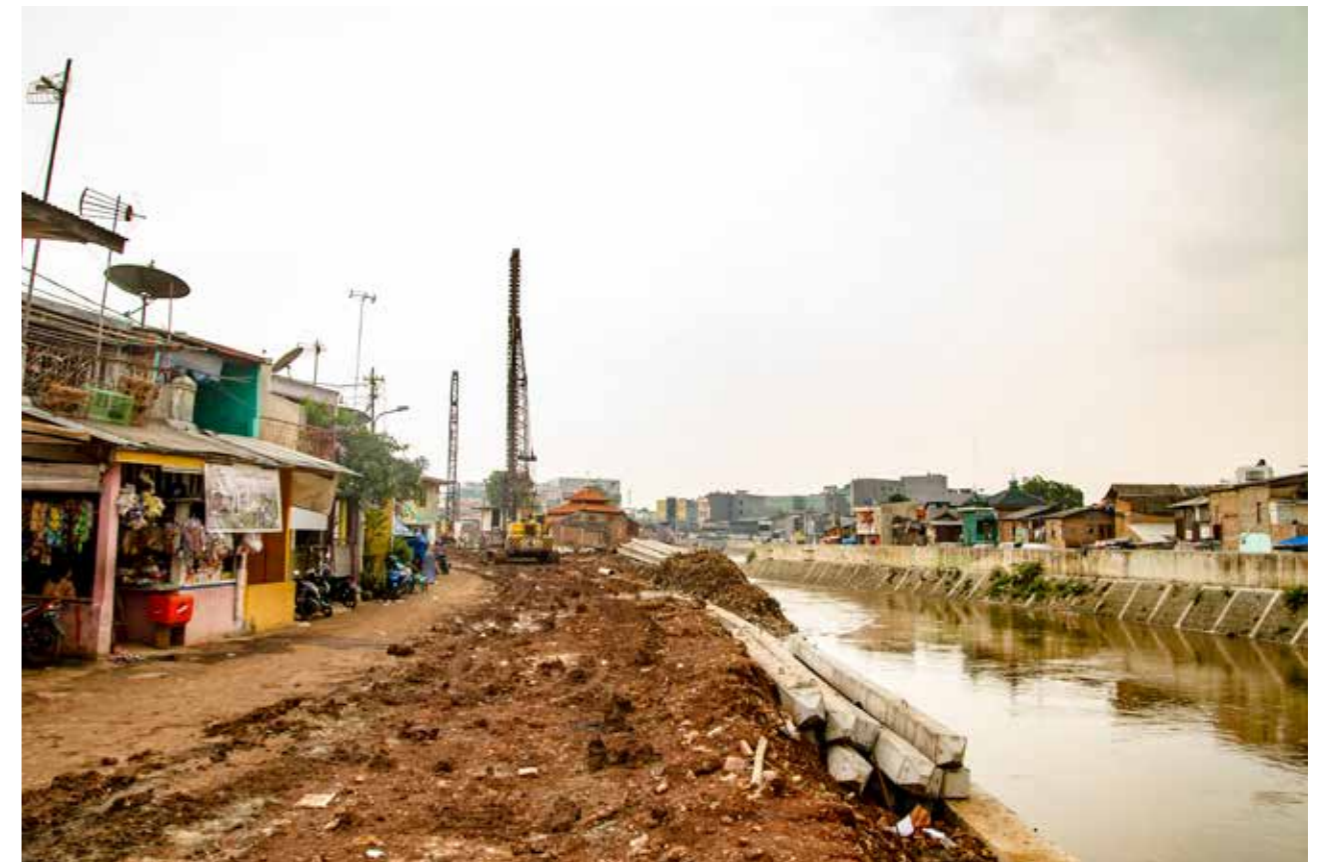
The space left by demolished homes along the Ciliwung riverbank in the Bukit Duri neighbourhood.