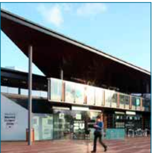
63. Conference Reception