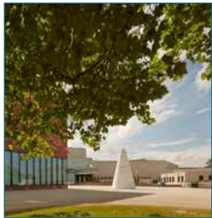
68. Warwick Arts Centre

CV4 8UW directs you to Kirby Corner Road where Arden is signposted.