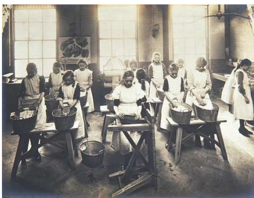
Tennyson Street Laundry Centre, Clapham: Washing Class, c. 1903

www.londonmet.ac.uk/thewomenslibrary/ aboutthecollections/source-notes/sources- education.cfm