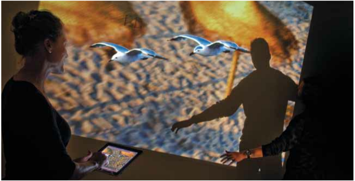
Figure 7. An illustration on how the prototype will be tested in the snoezelen house at Soelund by the residents and pedagogues.

The prototype was developed through an iterative process between the designer and technical people on the one hand and the village on the other hand. The old Personics game was given a new interface and a new game underpinning the communication between the staff and residents was developed.