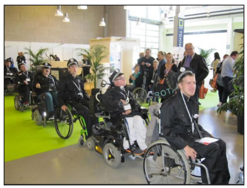
Figure 2. Students from Egmont folk high school on a study trip to the exhibition "Health & Rehab 2010" in Copenhagen, acting as "accessibility police" and testing the new assistive technologies exhibited.

In the HandiVision project the school established a course called "The innovative user" as a platform for learning and innovation through dialogues with companies. An important step in this process was to develop the necessary competencies and methods suitable for engaging in participatory design processes in order to develop new assistive technologies and services together with companies. This living lab was founded on the strong positive values and enthusiastic energy of the students and presented to the companies as an innovation partnership.