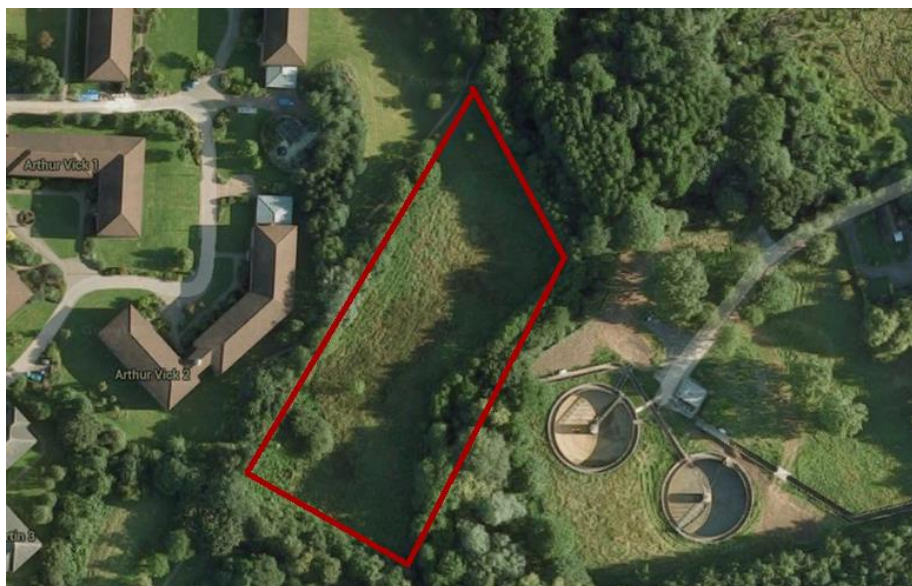
Figure 1 Aerial View of Potential Site Location

Roger Boxall from Estates had suggested that the area near the allotment society behind Arthur Vick would be suitable for EWB-Warwick, as it is near central campus, but is slightly hidden away. The site is on a floodplain near a stream, which runs along the back. There is a footpath by the front, which runs alongside the tree line. The nearest utilities are by Arthur Vick, however a small moat exists between there and the tree line. See Figure 1 below.