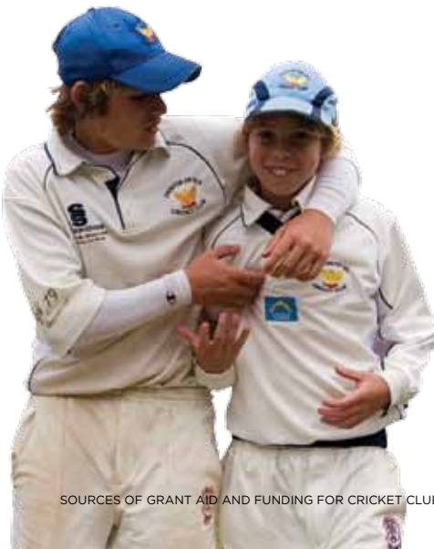
SOURCES OF GRANT AID AND FUNDING FOR CRICKET CLUBS

Rateable Values are reviewed every five years. A revaluation of all rating assessments took place on 1 April 2010 with the next revaluation due on 1 April 2015. Clubs will be aware of the 2010 Rating List entry which can also be ascertained by searching on the VOA website as above. Where the 2010 Rating Revaluation resulted in a large change in Rateable Value (up or down), the Government introduced a scheme of Transitional Rate Relief (TRR) for England only which set a cap on the chargeable increase on the following basis.