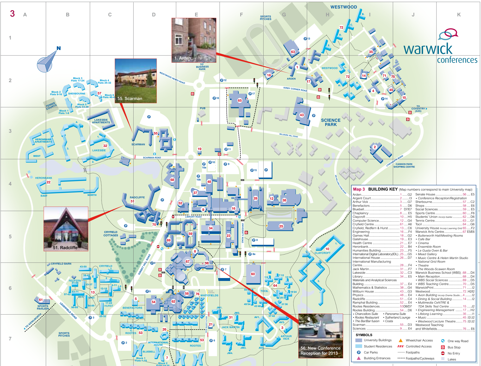
Map 3 BUILDING KEY (Map numbers correspond to main University map)