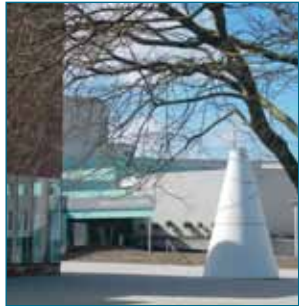
67. Warwick Arts Centre

CV4 8UW directs you to Kirby Corner Road where Arden is signposted.