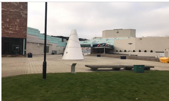
Right side to Senate House and entrance to Warwick Arts Centre