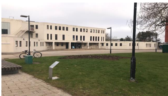
Front entrance site to Senate House