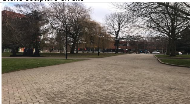
Central intersecting path between Library Road and the Students' Union