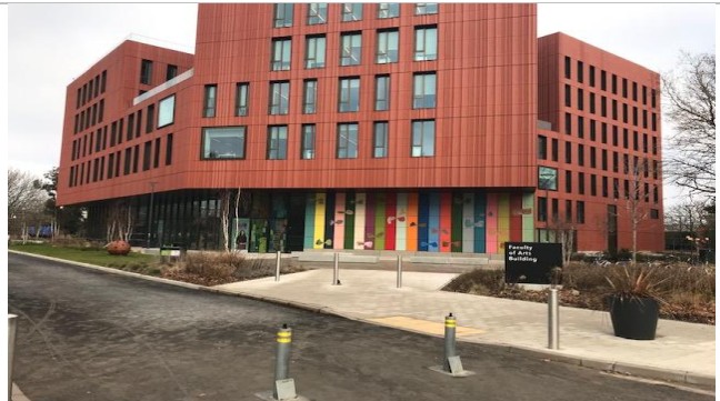
Faculty of Arts building