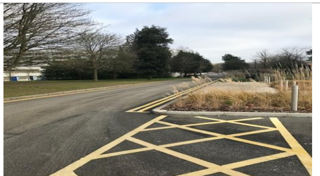
Road located next to the site from the Spinal route