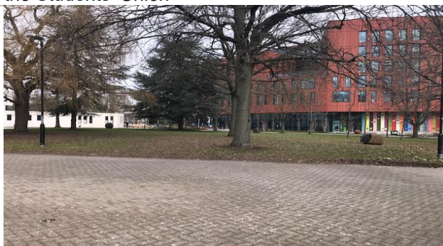
Green space outside the Faculty of Arts