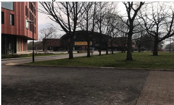
Path alongside Faculty of Arts building leading to the Oculus