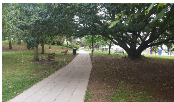
Intersecting path through the site