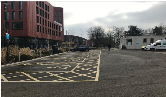
Blue badge parking at the rear of Senate House