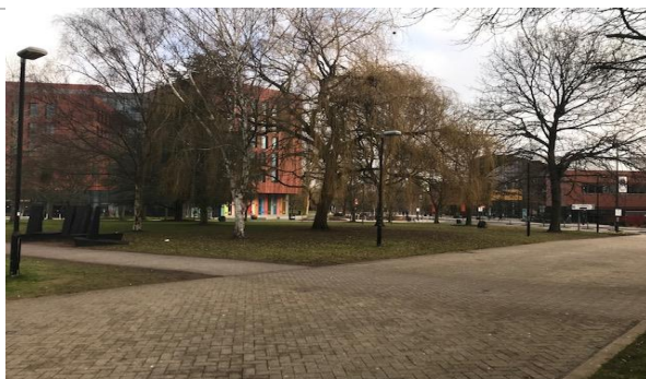
Path running alongside the Faculty of Arts