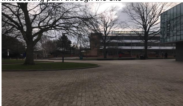
Path leading to the Students' Union and Oculus