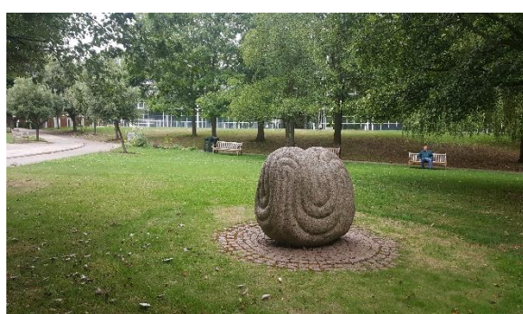
Stone sculpture on site