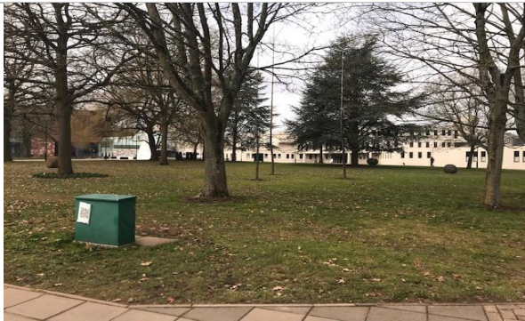
Green space to the left of Senate House as you exit the building