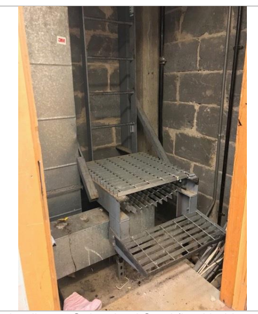
Steps leading to Galvanised Steel fixed ladder