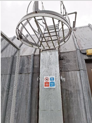
Vertical Ladder up to main roof with Salto padlock