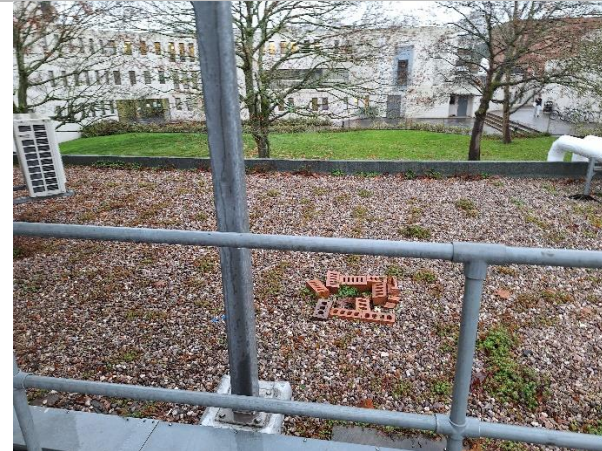
Loose ballast beyond edge protection on lower roof.