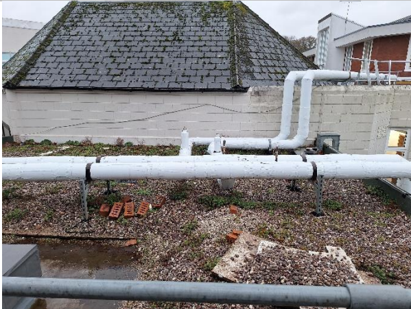
Example of pipework and loose articles beyond edge protection