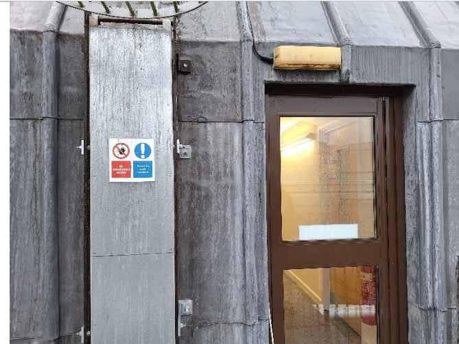
Internal 2 nd floor fire escape/roof access