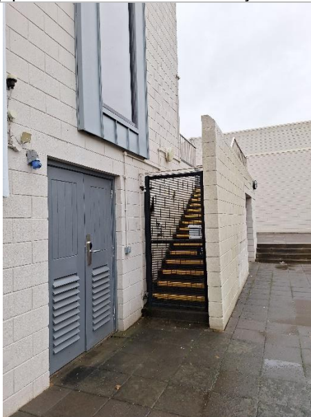
Southern side entrance gate to lower roof (next to plant room)