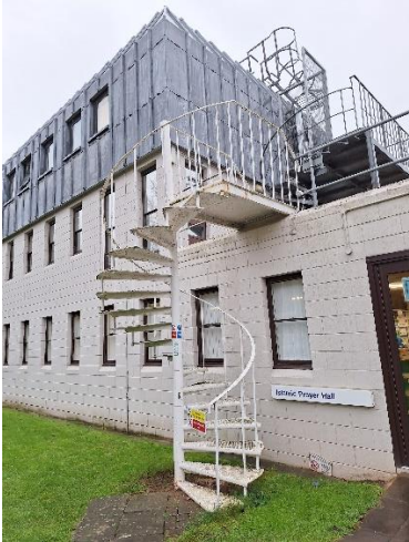
Northern side external stairwell