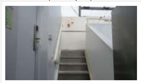
South access to the internal gantry