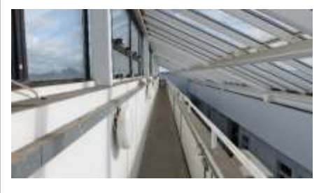
Gantry from South to North