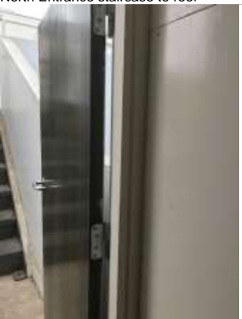
Door with Salto access leading to North roof staging area