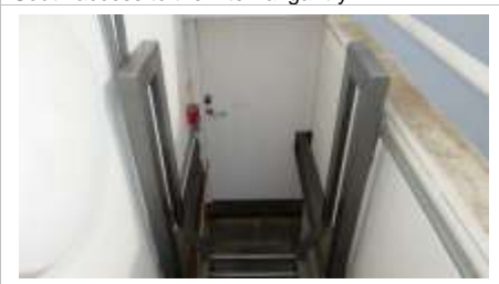
Access to North roof from internal gantry