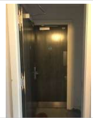
South Entrance (Salto Required) on first door