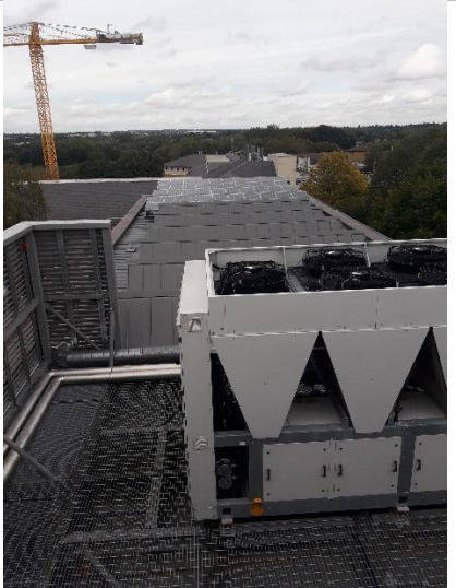
Example of typical plant