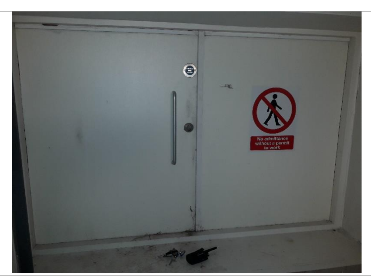
Example of hatch type door leading out onto roof (Salto)