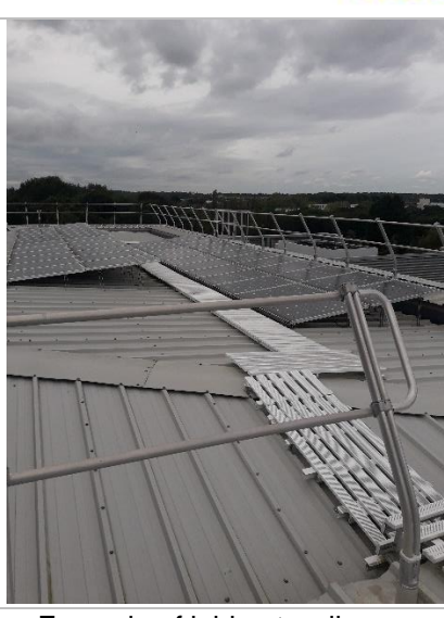
Example of laid out walkways