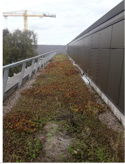
Vegetation growing, causing potential trip hazard and loose ballast