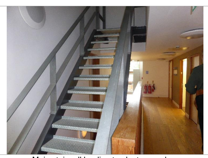
Main stairwell leading to plant room door