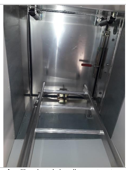
Example of ceiling hatch leading out onto roof (Salto)