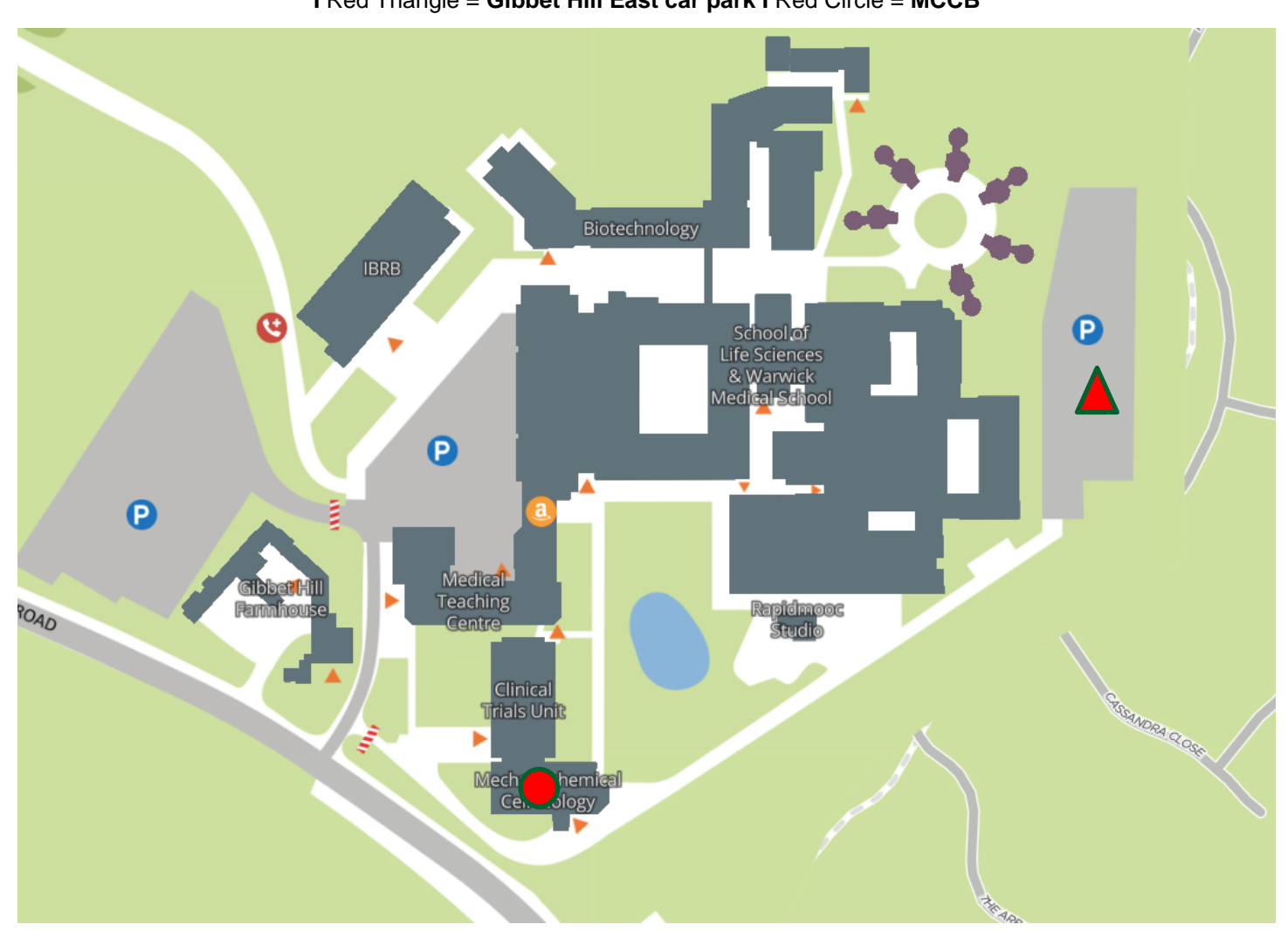
I Red Triangle = Gibbet Hill East car park I Red Circle = MCCB