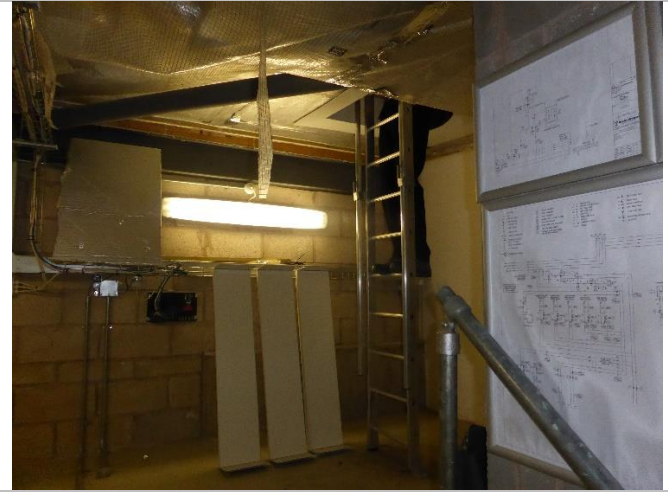
Example of vertical access ladders to roof