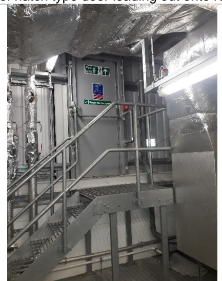
Roof access door leading out onto higher level roof (Salto)